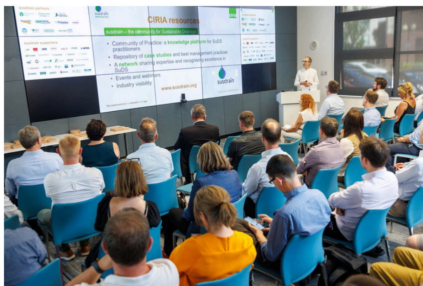
2024 susdrain SuDS Awards in Cardiff