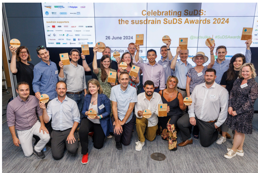
2024 susdrain SuDS Awards winners and highly commended