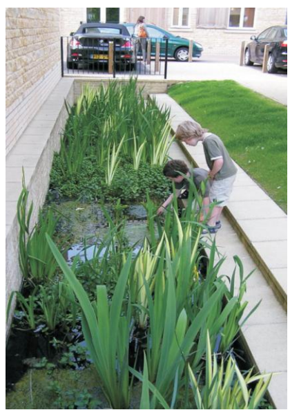
Figure 3 Stamford and Lamb Drove

In the UK there is yet to be delivery of WSUD or integrated water management in housing developments. Building Regulations provide a baseline compliance for water efficiency and some developers are striving for better performance