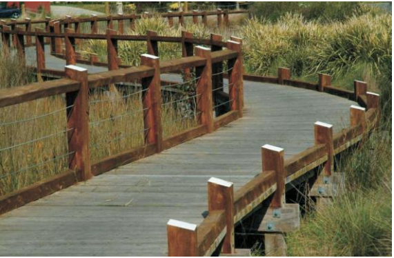
Figure 2 Urban water management

The requirement for sustainable water management will increase in response to environmental and legislative plans. WSUD will become crucial in providing an inclusive approach to spatial planning, urban design and water management, helping to overcome the challenges of delivering more sustainable developments within a changing climate.