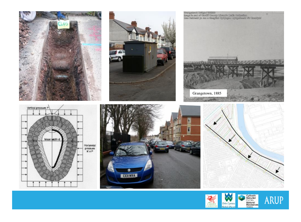
Feasibility .... Outline and optioneering.... Consultation.... Final design