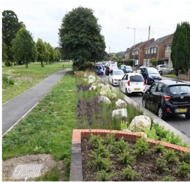
Figure 5: Rain garden with wildflowers and trespass prevention boulders July 2019