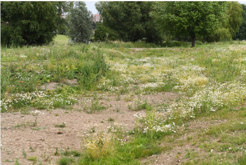
Figure 3: Swale further to establishment of vegetation July 2019