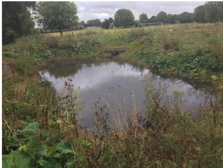
Figure 1: Detention pond in action - flooding on 25 th September 2019