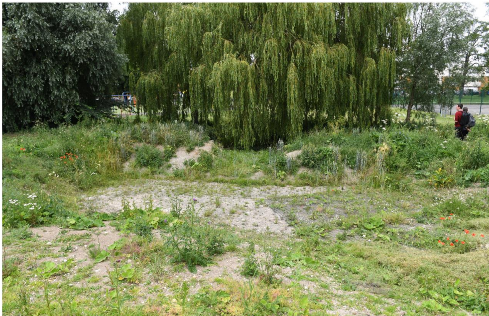
Figures 4a and 4b: Detention Pond - July 2019