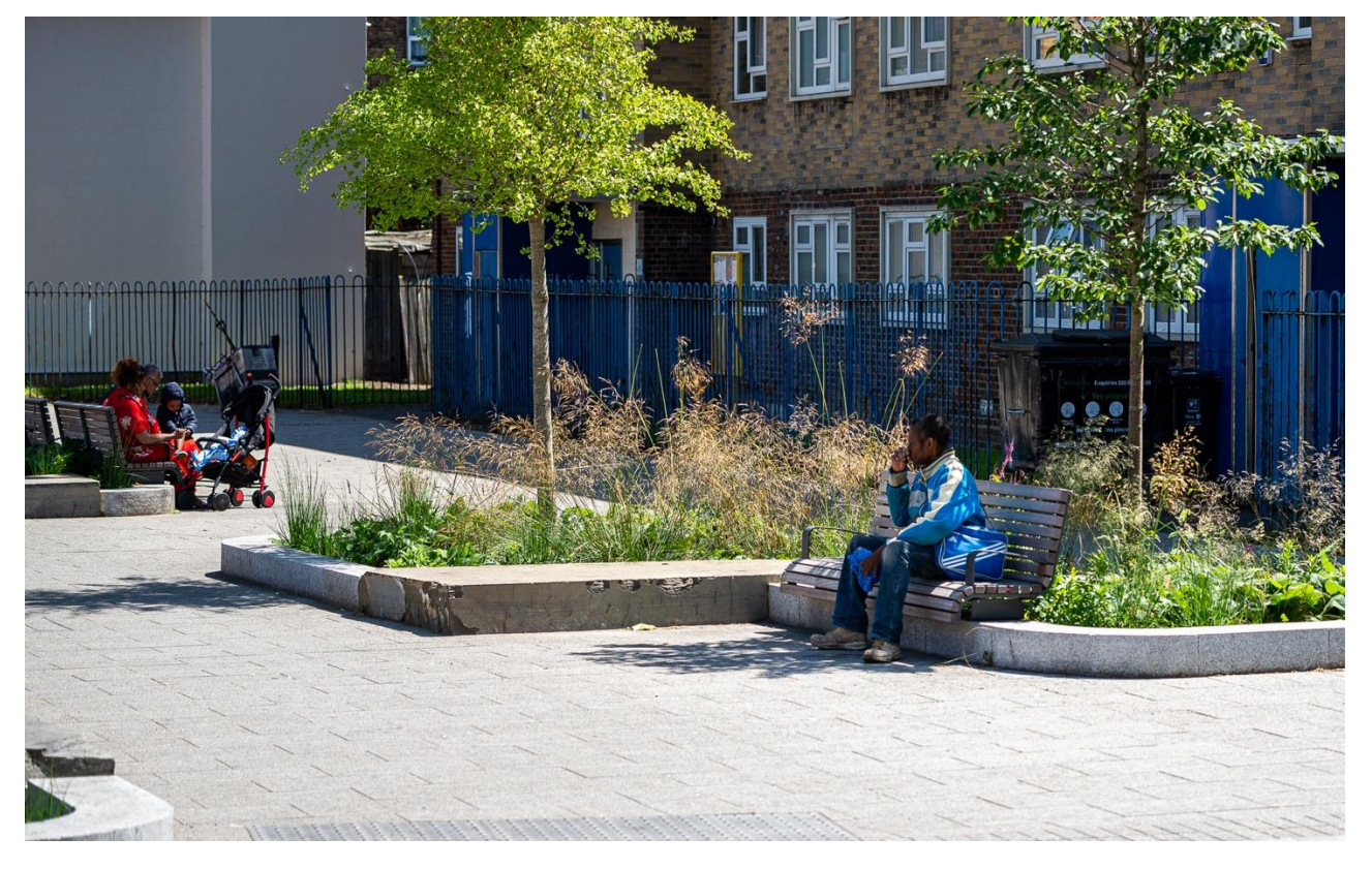
Newly created park with tree planting and seating