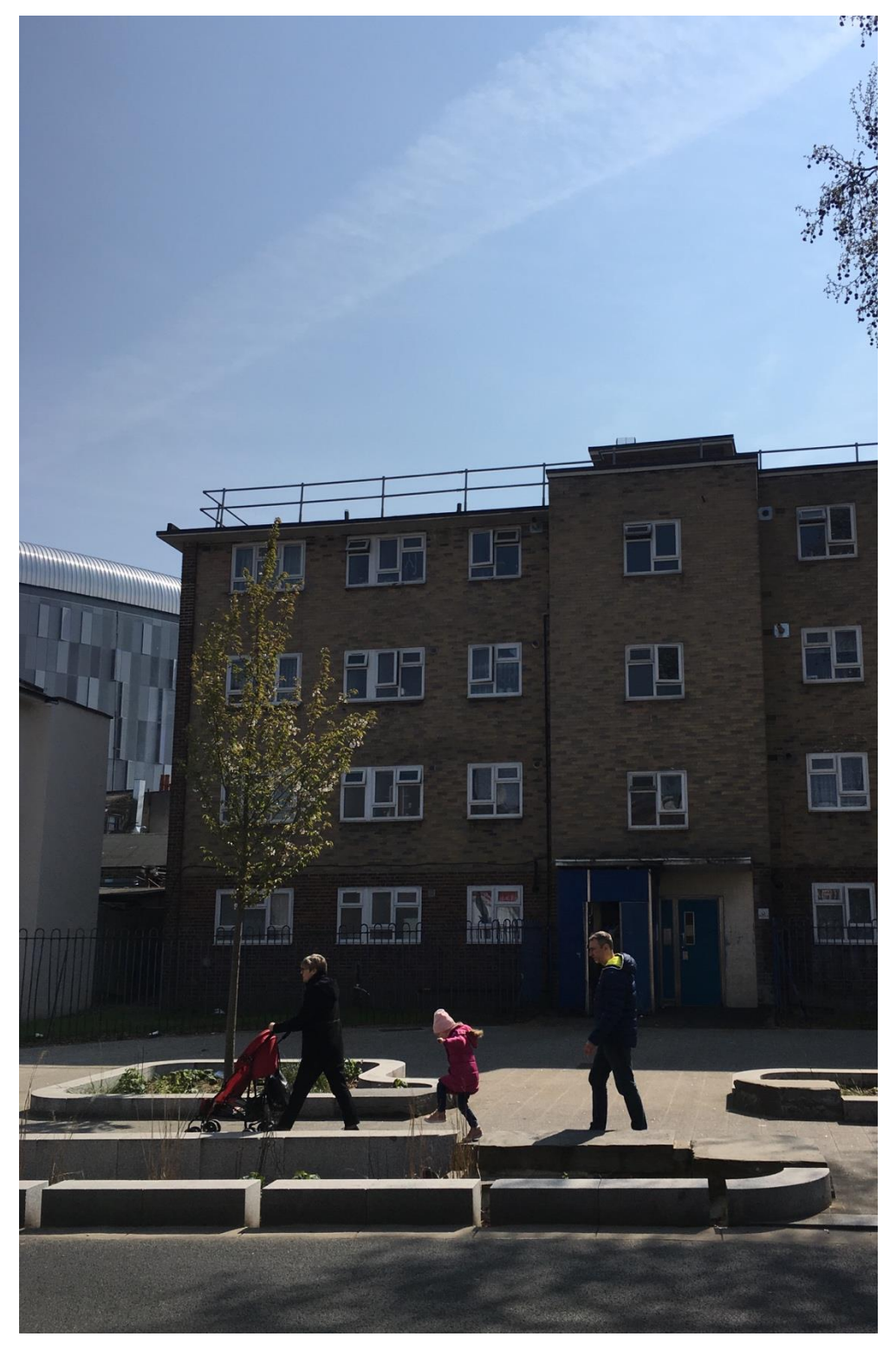
Playable SuDs with Raingarden stepping stones (before planting established) Image muf