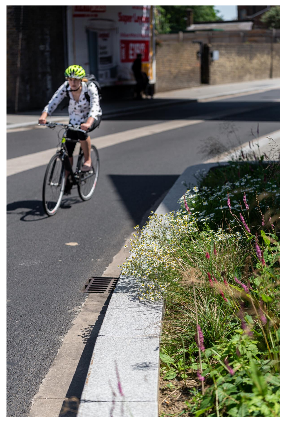
\label{lem:model} \textbf{Modal change through narrowing the road and adding roadside raingardens and planting}