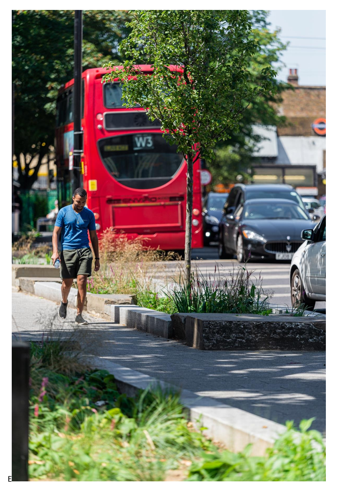
Roadside raingardens with established planting