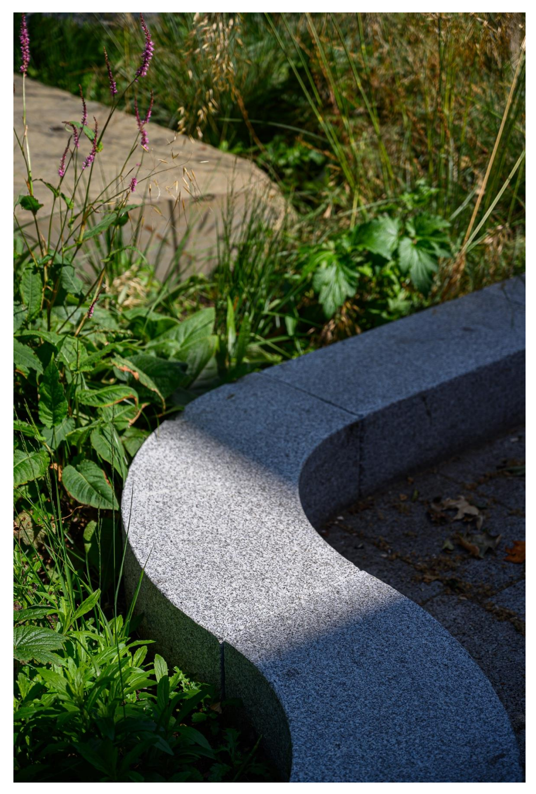
Simple material palette of sustainably sourced European granite and Scottish Caithness stone