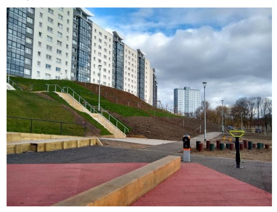
Image 6: View up to the flats from the play area, showing the steep slope and various planting options used.