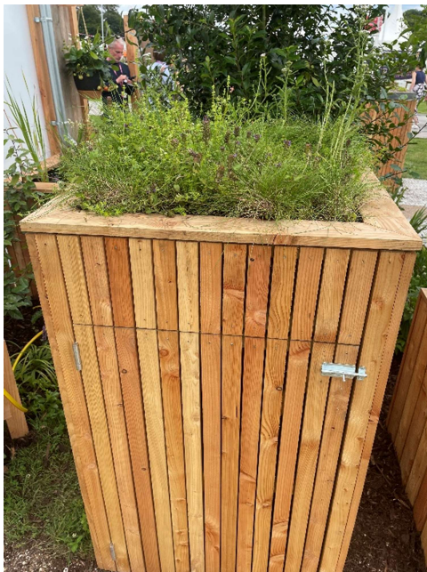
Figure 7: Green Roof Bin Store

Rainwater is attenuated by the green roof bin store helping to slow the flow.