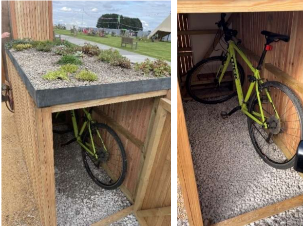
Figure 12: Green Roof Cycle Store with in-built Water Butt

Rainwater is attenuated by the Green Roof Cycle Store (stores 109 litres of rainwater or 22 watering cans) and any excess filters into the in- built water butt for reuse.