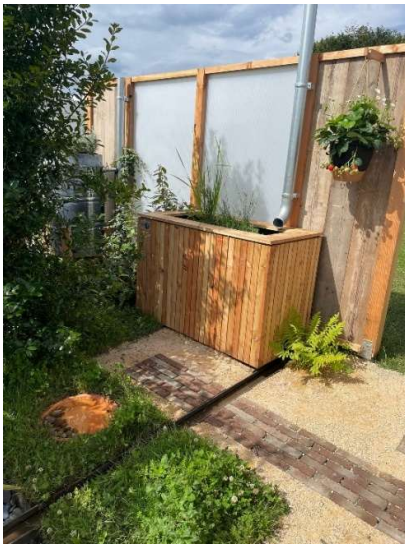
Figure 9: SuDS Pod (GreenBlue Urban)

The Self-Watering Hanging Basket reduces the need for manual watering as rainwater is fed to the plants from the water reservoir via the wicking system.