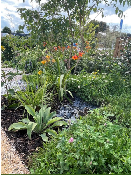
Figure 10: Rain Garden

The Rill outfalls into the Rain Garden where surface water can drain via infiltration into the ground.