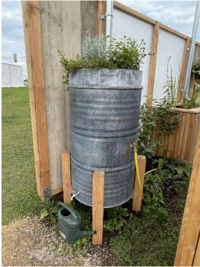
Figure 6: Slow-Release Water Butt

Rainwater is harvested for reuse via the Slow-Release Water Butt which stores 210 litres or 42 watering cans of rainwater. It has two different tap heights so that half of the water butt can be drained in preparation for heavy rainfall.