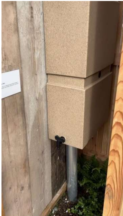
Figure 11: Slimline Wall Mounted Water Butt

Rainwater is harvested for reuse in the Slimline Water Butt.