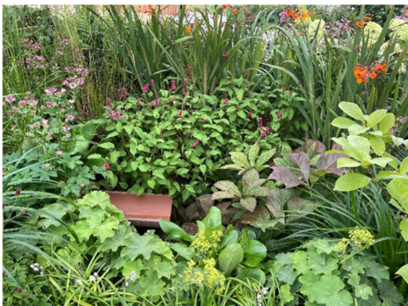
Figure 5: Rain Garden

The Rill outfalls into the rain garden where surface water can be attenuated and drain via infiltration into the ground.