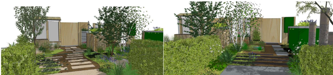
Figure 1: Unpave the Way Garden Visualisation- Leon Davis Design

The garden featured two differing front garden designs which both incorporated driveway space. Garden A was a SuDS retrofit DIY low-budget garden design which focused on using reclaimed paving materials and homemade SuDS features. Garden B was a new higher budget front garden design which utilised specialist ready-made SuDS products.