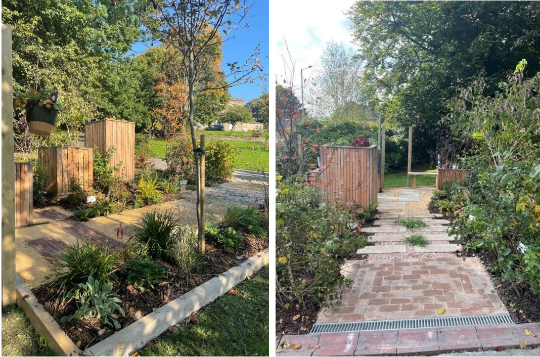
Figure 3: Unpave the Way Garden at Whitaker Park, Rossendale