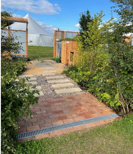
Figure 8: Garden A: SuDS Retrofit Design

Any surface water runoff from the reclaimed brick pavers is captured by the swale on the garden boundary or by the cut off drain.