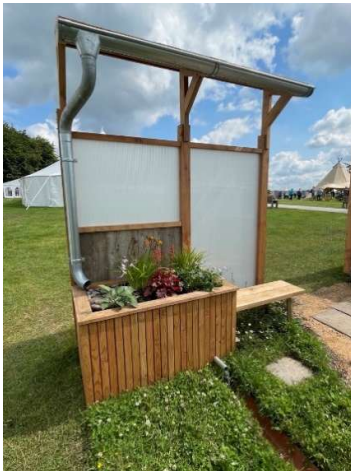
Figure 4: SuDS Downspout Planter

Rainwater flows down the downpipe and into the SuDS Downspout Planter (stores 335 litres of rainwater or 67 watering cans) where rainwater is attenuated within the soil and a layer of clean stone until it is slowly released into the Rill.