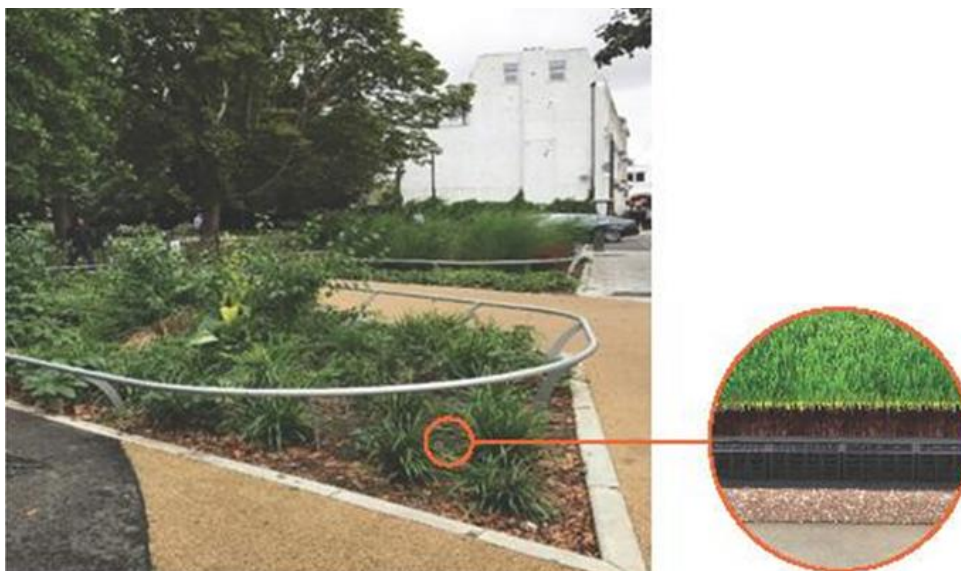
Fig 1: Example of rain garden at Melina Road, Shepard’s Bush:

The Melina Road SuDS scheme has involved the installation of four new rain gardens in the existing pedestrian area at the southern end of the road. The rain gardens were constructed as typical bio-retention areas, with a topsoil surface that has allowed appropriate planting, and geocellular units beneath to provide the required attenuation.