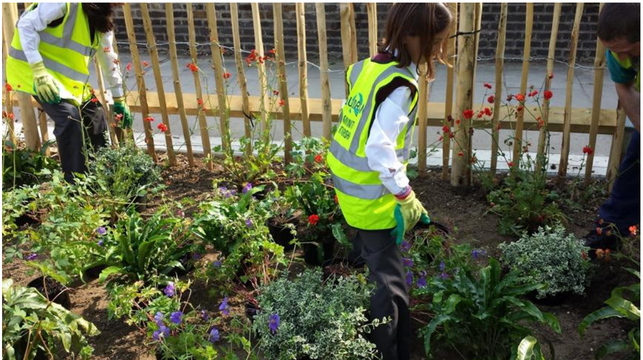
Fig 5; Local school engaged in planting at Melina Road, Shepard's Bush