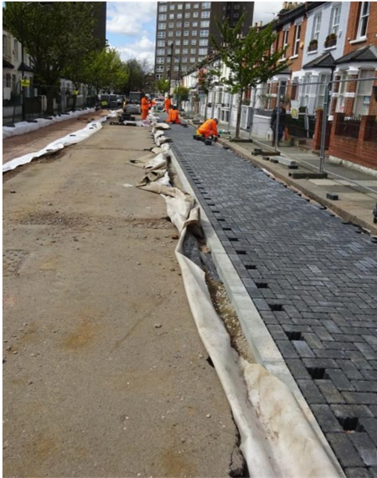
Fig 4: Permeable block paving being installed at Mendora Road, Fulham