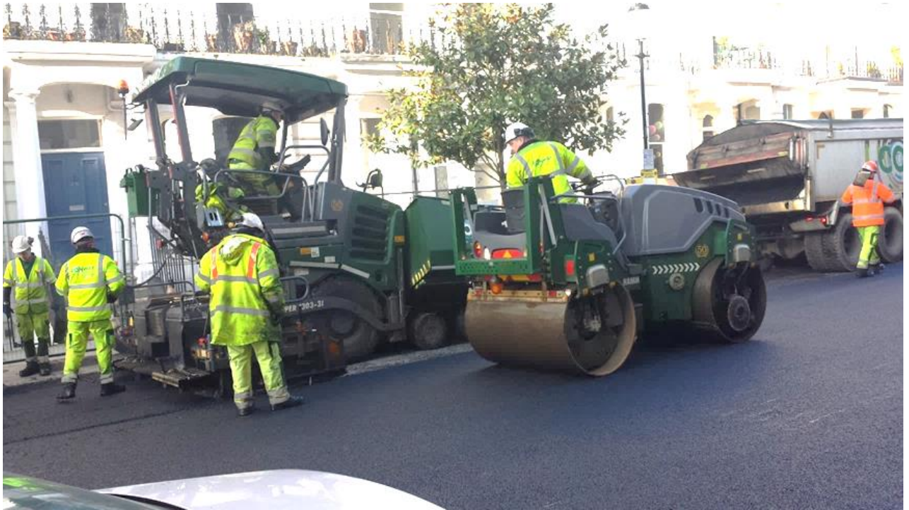
Fig 6: Resurfacing Arundel Gardens, Kensington with porous asphalt