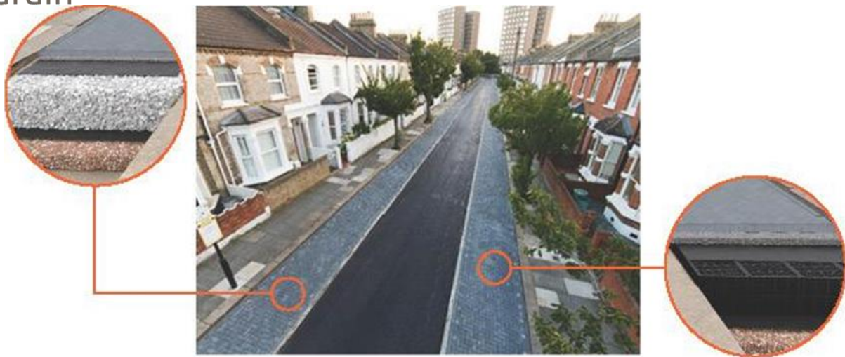
Fig 2: Mendora Road, Fulham – block paving on each side of the road

At Arundel Gardens, Kensington , porous asphalt has been laid across the whole width of the road with enhanced attenuation within a shallow layer of geocellular boxes. This attenuation is separated in cascades with flow controls between them to maximise use of the attenuation and to minimise pass forward flows.