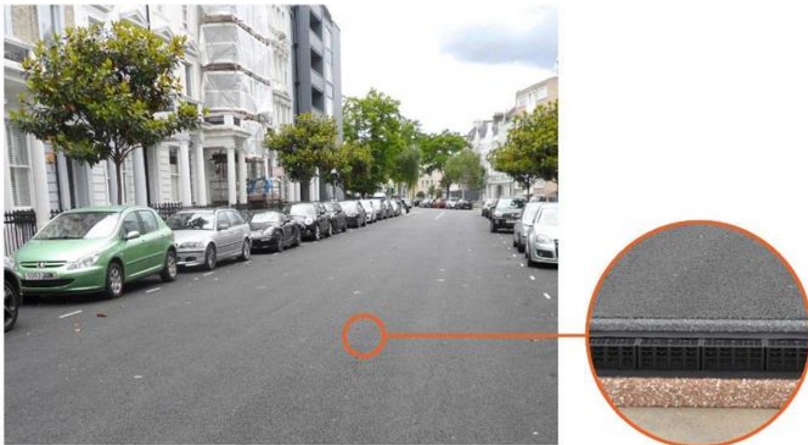
Fig 3; Arundel Gardens, Kensington showing the porous asphalt across the road

At Arundel Gardens, Kensington , porous asphalt has been laid across the whole width of the road with enhanced attenuation within a shallow layer of geocellular boxes. This attenuation is separated in cascades with flow controls between them to maximise use of the attenuation and to minimise pass forward flows.