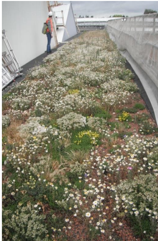
Figure 3 Green roof in June 2013