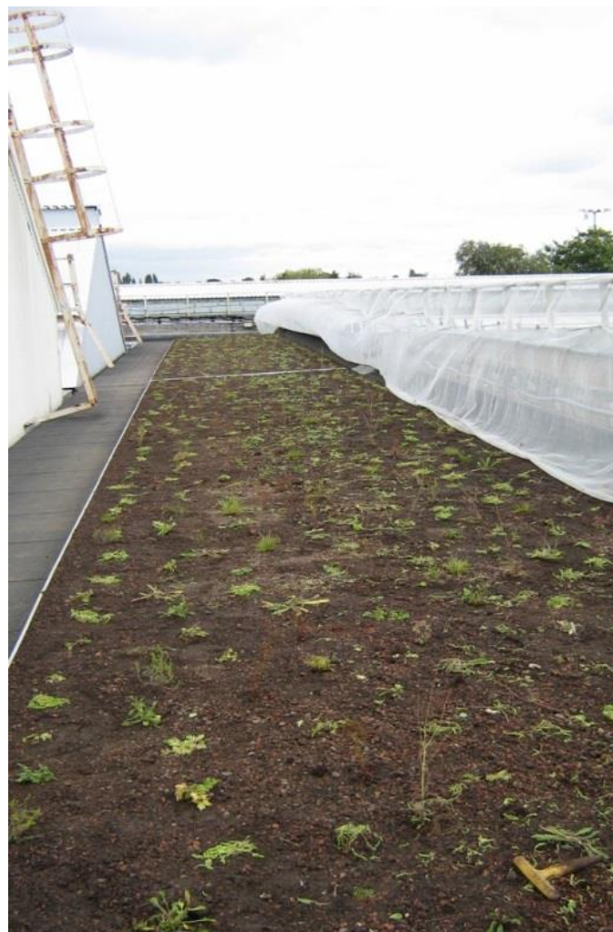
Figure 2 Green roof in September 2012

Retrofitting on operational railway had to follow the rigorous assurance and safety procedures of London Underground without any interruption of service. Logistics during installation and performance of the experimental approach were the important outcomes so far. Monitoring of water attenuation has not been completed.