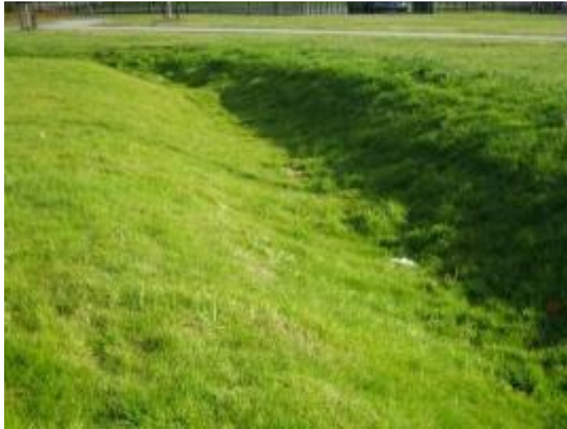
Figure 3 Mown swale (David Singleton)

Bio-swales are very shallow and have been carefully graded side slopes to enable mowing. This is now under the direction of school staff who keeps vegetation longer to promote species diversity. Several re-sowings and planting of marginal and aquatic species have occurred since 2005.