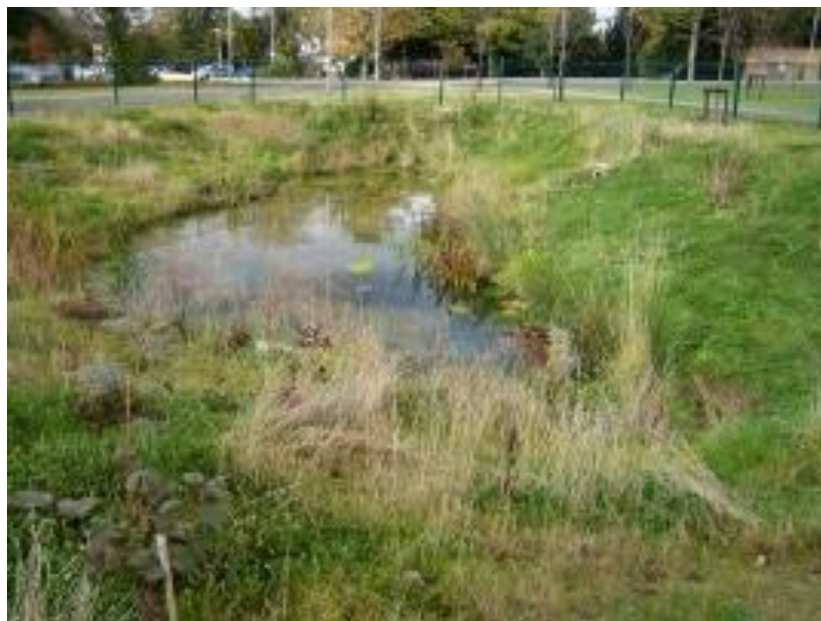
Figure 4 Attenuation basin (David Singleton)

Against the wishes of staff swales were originally amenity mown. This regime has now been relaxed to enable plant communities to diversify.