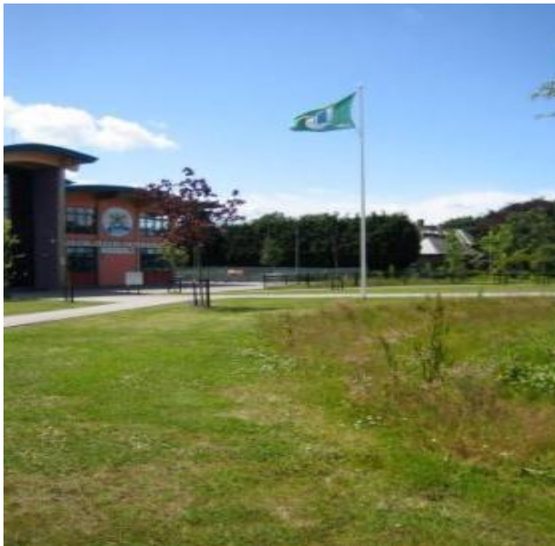
Figure 2 Summer Flag. The Eco-Schools flag being proudly flown at Bushloe (David Singleton)

The SuDS scheme uses a 'treatment train'. The car parking and external works were redesigned to maximise surface SuDS components and reduce costs. A planning condition (imposed after consultation with Oadby and Wigston Council) required the landscape to be an environmental teaching resource and this is a major feature of the SuDS. Some limited underground drainage was used, such as to connect under heavily trafficked areas and the play areas that surround the building.