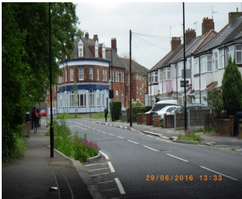
Figure 9 Approach to the rain gardens