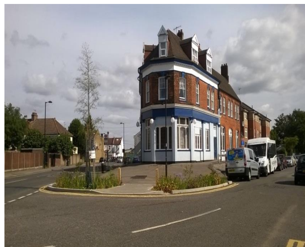
Figure 4 Alma Road/Scotland Green Road junction after with permeable footway

It was recognised that the existing traffic calming measures, two speed cushions, in this particular stretch of road did not help to reduce speeds to the required 20 mph. This posed some risk to the nearby Alma Road Primary School. The speed cushions were removed and replaced by rain gardens 4 and 5 (RG4 and RG5). These act as horizontal traffic calming by giving the impression that the road is narrowing.