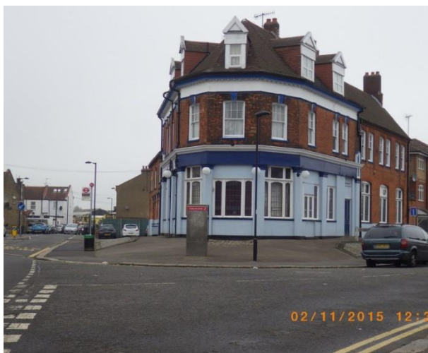
Figure 3 Alma Road/Scotland Green Road junction