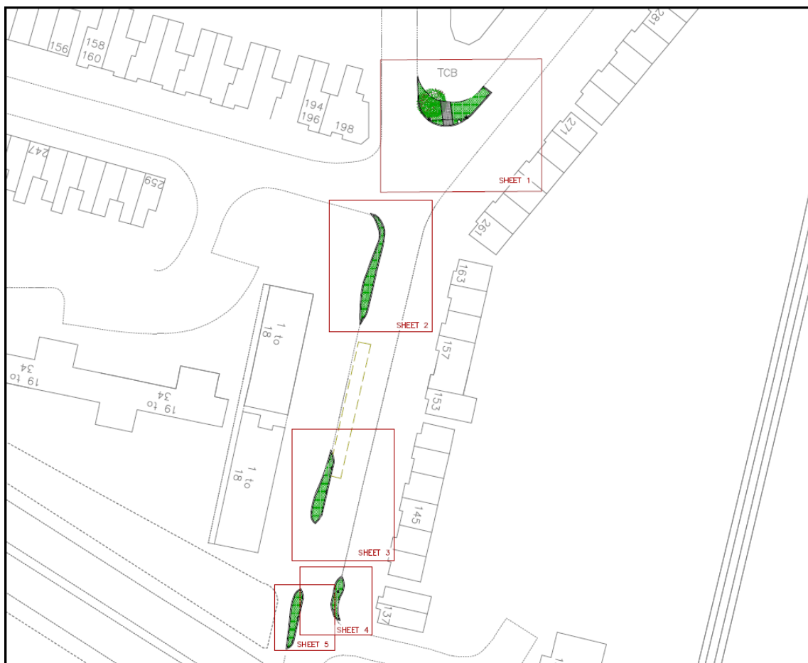
Figure 5 Rain Garden Layout

Due to existing cross-overs there was little opportunity to construct rain gardens on the eastern side of Alma Road, therefore most of the rain gardens were installed on the western side.