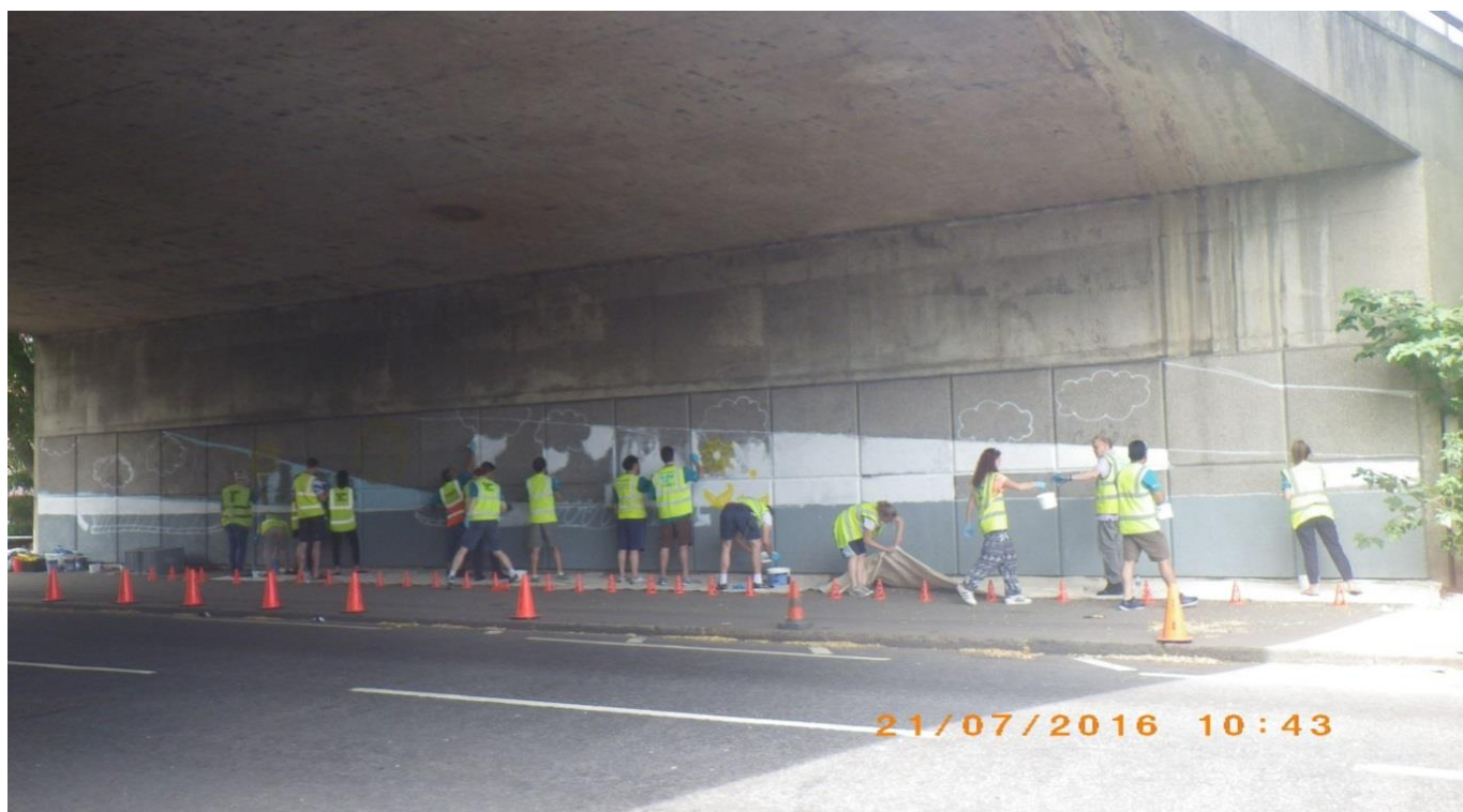
Figure 10 Volunteer event – mural painting