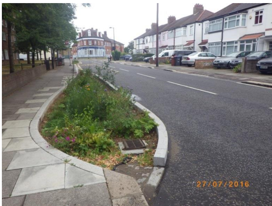
Figure 8 Gully retained

The rain garden plants manage contaminants from road runoff. Specific plants that were both drought tolerant and could survive in waterlogged conditions were chosen.