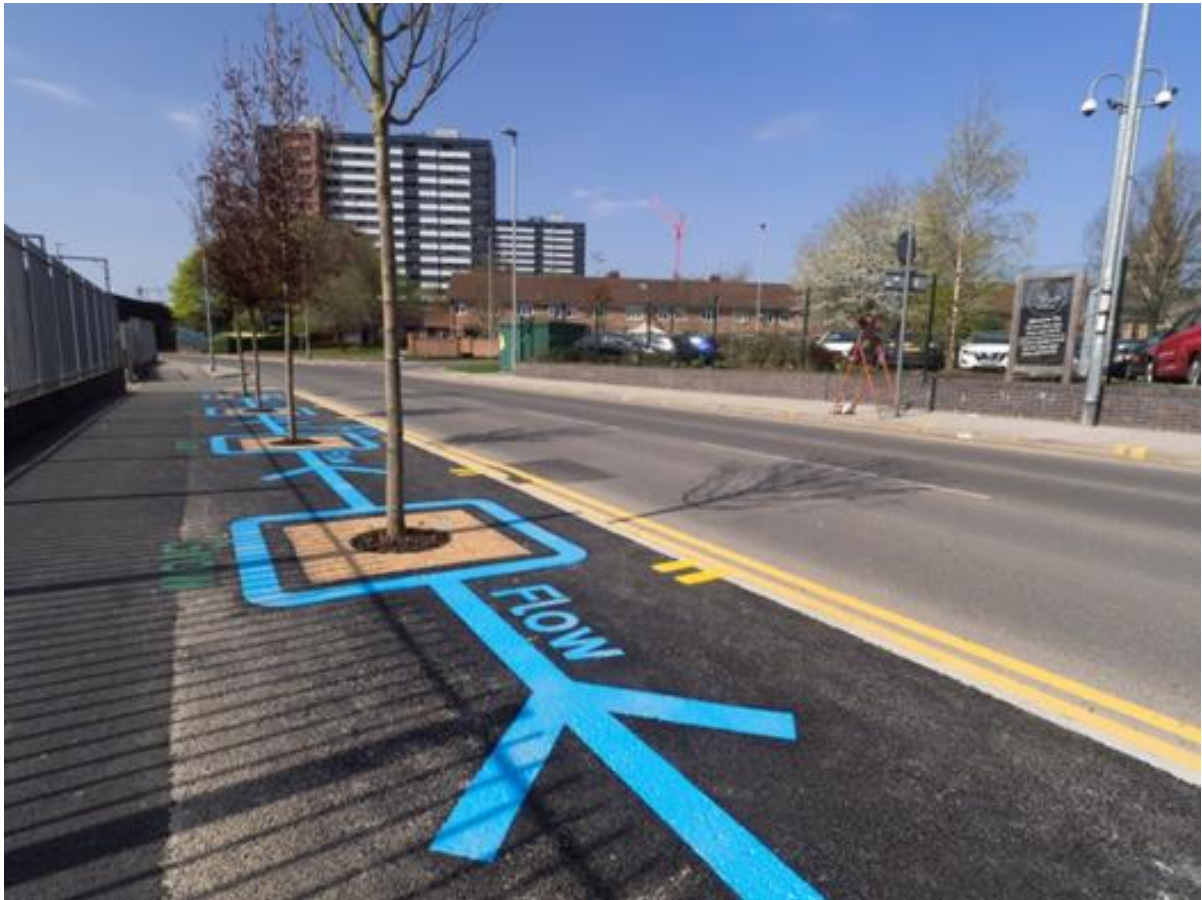
Fig 1: East Ordsall Lane - completed scheme with on ground markings

(Part of Salford City Council's Green City Programme)