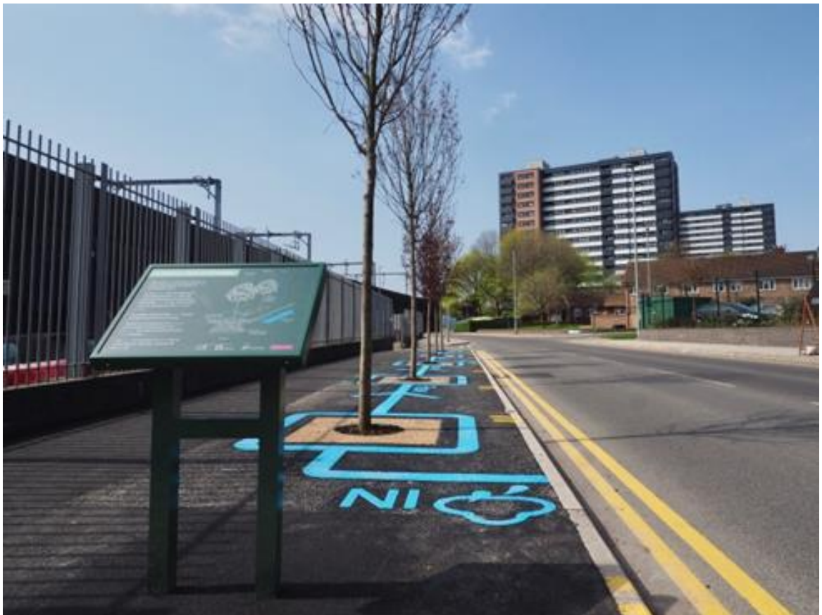
Figs 1-4: Before, mid construction and after photos