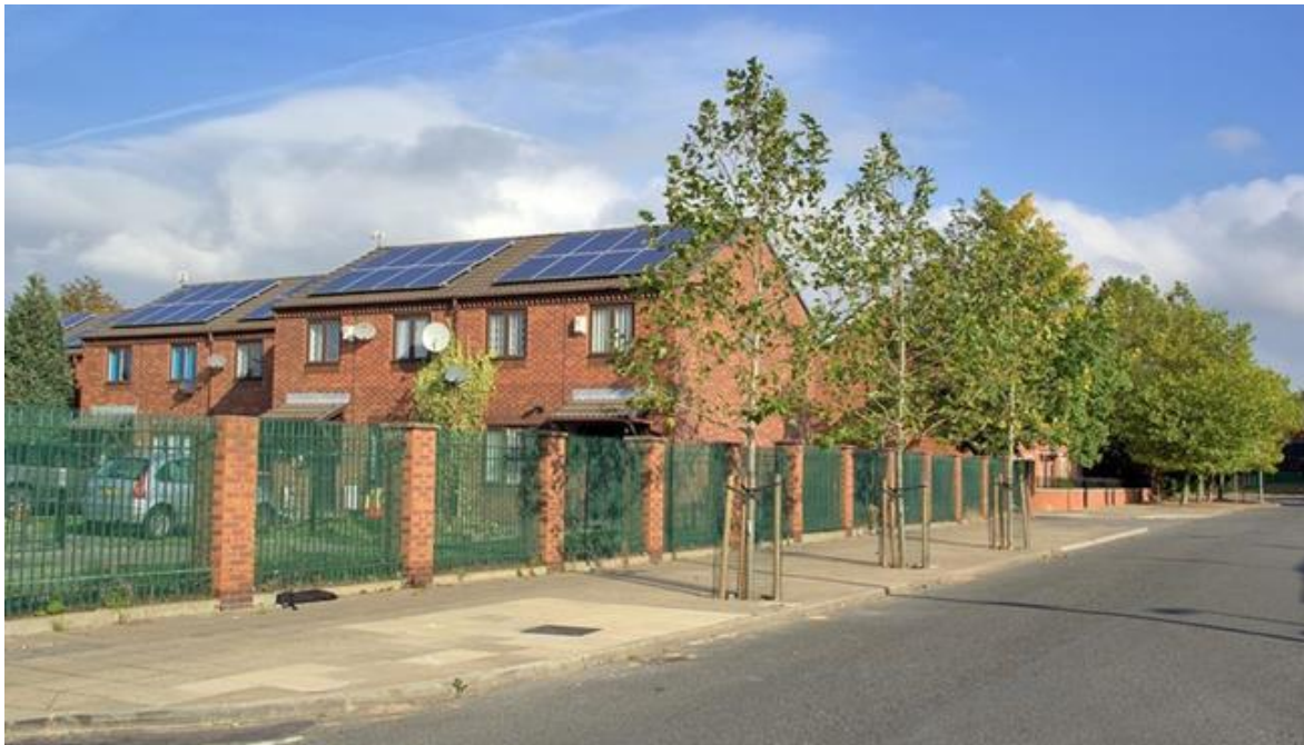
Fig 6: Howard Street, sister scheme delivered by City of Trees, Salford City Council and Urban Vision