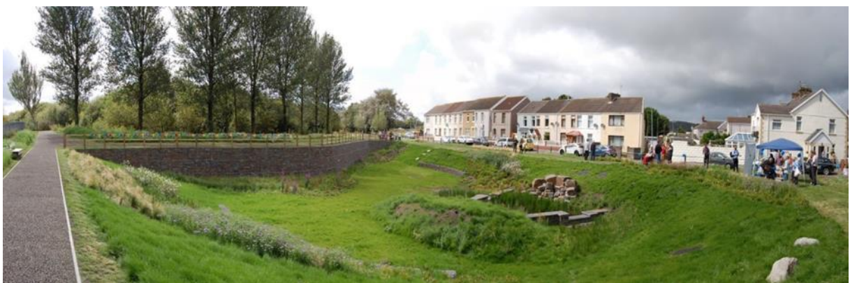
Fig 3 Cambrian North Basin after construction (August 2017)