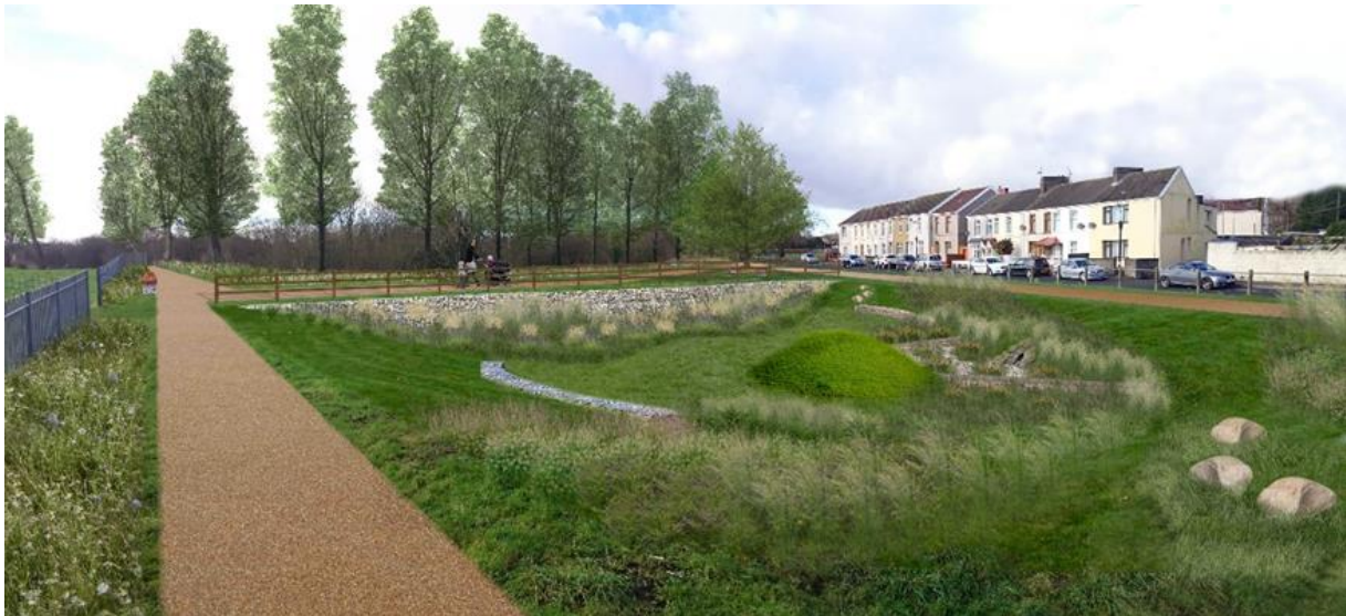
Fig 2 Cambrian North Basin artist's impression