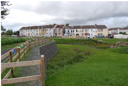
Fig 6 Gabion wall and fencing