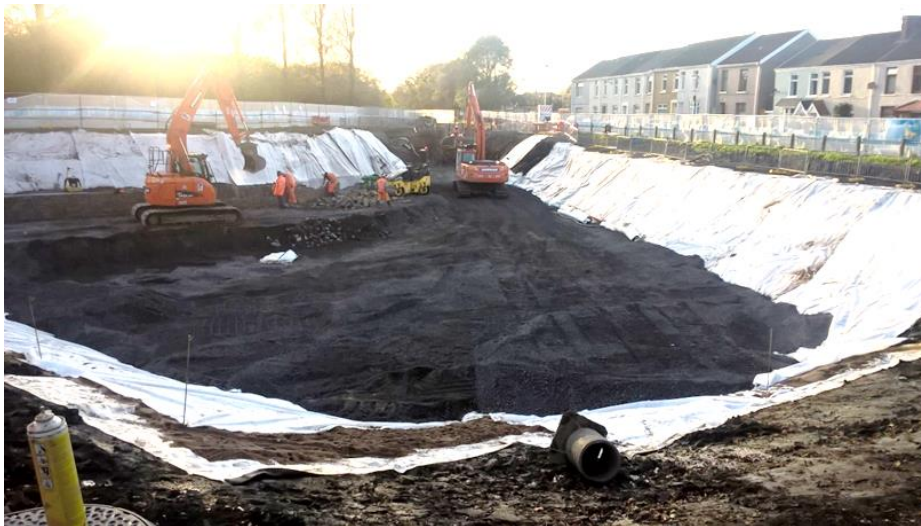
Fig 10 Cambrian North Basin excavations

The project brought together Arup landscape architects, geotechnical and civil engineers and environmental consultants who developed the design with Morgan Sindall, considering buildability from the outset. A 3D model was created to manage the reuse of the 3,000 m 3 basin excavations.