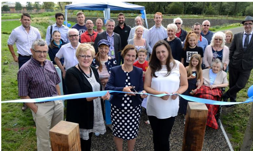
Fig 12 Community opening day (August 2017)