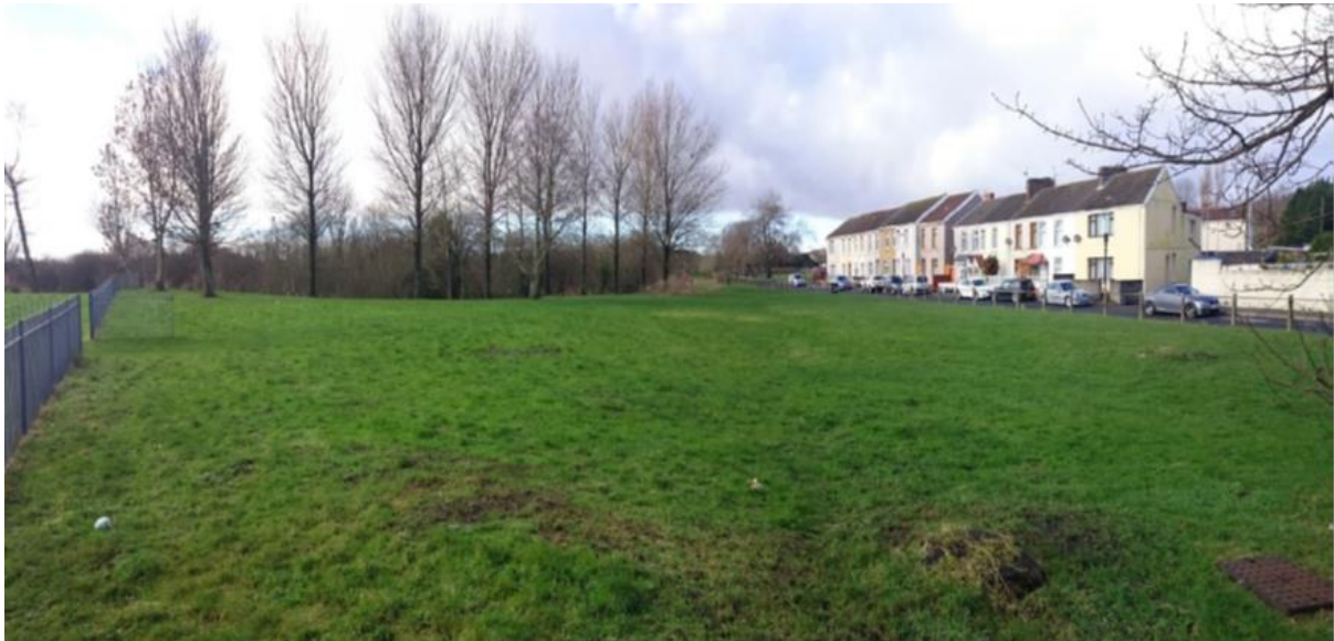
Fig 1 Cambrian North Basin before construction (February 2016)