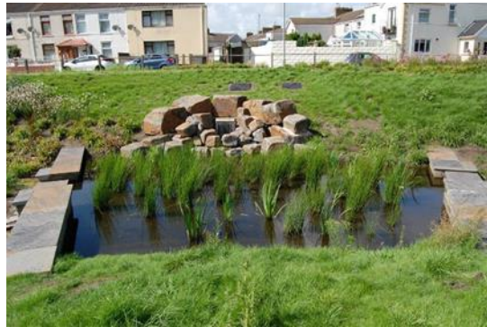
Fig 5 Sediment forebay