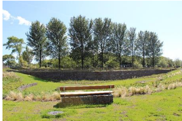
Fig 9 Bench