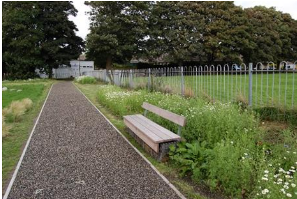
Fig 8: Bench and path linking footpaths

Amenity value has been added through promoting sustainable travel and health and wellbeing through the design. A new footpath provides important connections for the existing desire lines between the Llanelli Town Centre and the Wales Coast Path, previously linked by highway. Furthermore, the project has created three seating areas encouraging socialising and managing water on the surface has increased awareness of sustainable water management within the community.