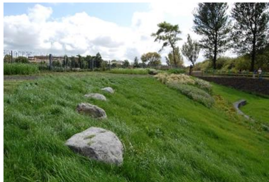
Fig 7 Landscaping boulders