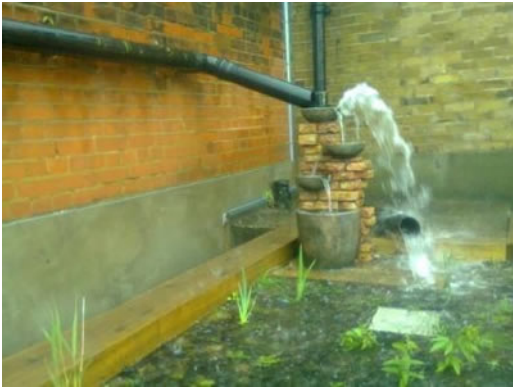
Figure 5. Heavy rainfall

With this in mind WWT designed a scheme that allows adults and children to get closer to wetlands through their involvement in scheme design, planting (each student planted at least one plant in their SuDS) and management.