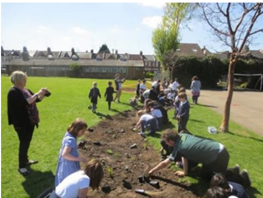
Figure 6 & 7 - Hollickwood School planting