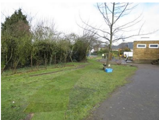
Figure 3. New tributary grass swale taking run-off from upper playground

Overflow from this then travels via a short length of a drainage channel into a narrow, 'tributary' grass swale and then into a larger grass swale which also carries additional surface water flowing off the tarmac playground in the upper school