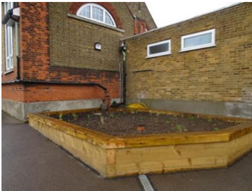
Figure 2: Bio-retention bog garden with seating showing disconnected downpipes and overflow drain

Rainfall from a portion of the roof space has been diverted to a newly-constructed raised bog garden planted with native wetland plants (and which also doubles as a meeting place with an integrated seating area for parents and children).