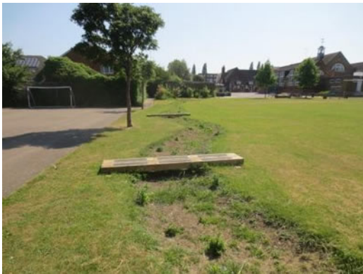
Figure 4. Detention area with bridges and planted with native plants

Exceedance flows travel into the surface water drain via a small retention area and overflow feature