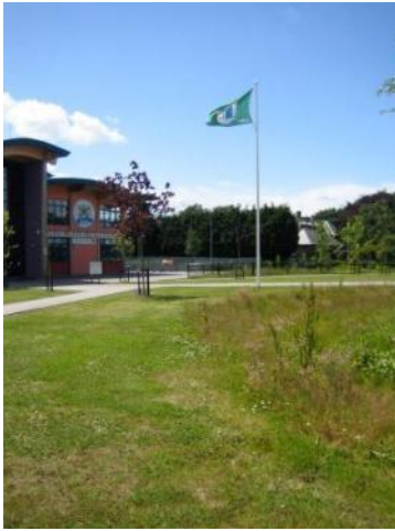
Figure 2 Summer Flag. The Eco-Schools flag being proudly flown at Bushloe (David Singleton)