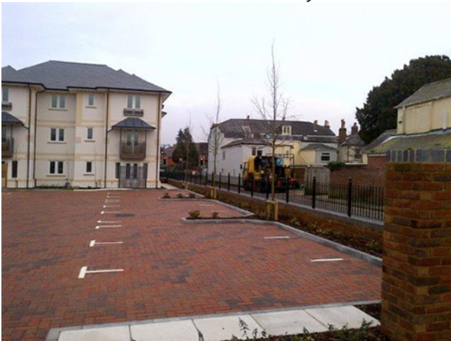
Main SuDS used

The Buckland area in Lymington, Hampshire is the site of impressive natural beauty, nestled between the seaside and partly covered by trees planted since the 18th century. When the Buckland House, a property located near the city centre, came under new management in 2012, the building and its adjacent car park underwent a significant redesign that managed to have minimum impact on the historic site. An area that previously functioned as a footpath was redesigned in order to extend the car park, and this design called for the removal of large street trees from the public right of way. In light of the removal of these trees from the public realm, the New Forest District Council mandated that at least three new trees be planted on the site to replace them. But it would not be enough to simply replace these mature trees in number, as the Council best management practice for trees requires them to be planted in generous soil volumes to help them become large functional trees that will benefit the local community.