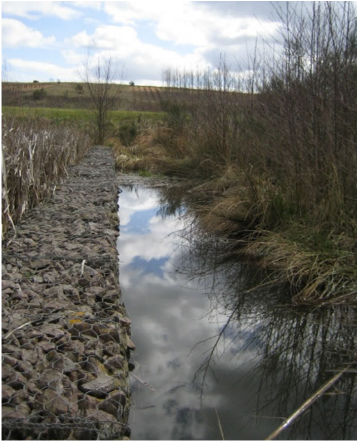
Figure 4: Stilling pool and gabion in system 2 reed bed 2