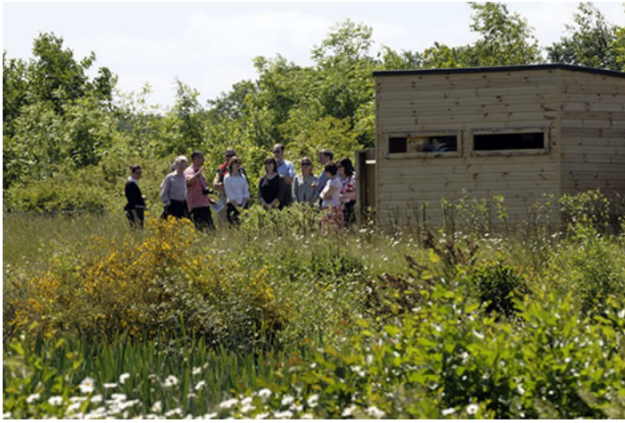
Figure 6: New building viewed over the Marl Pit attenuation pond