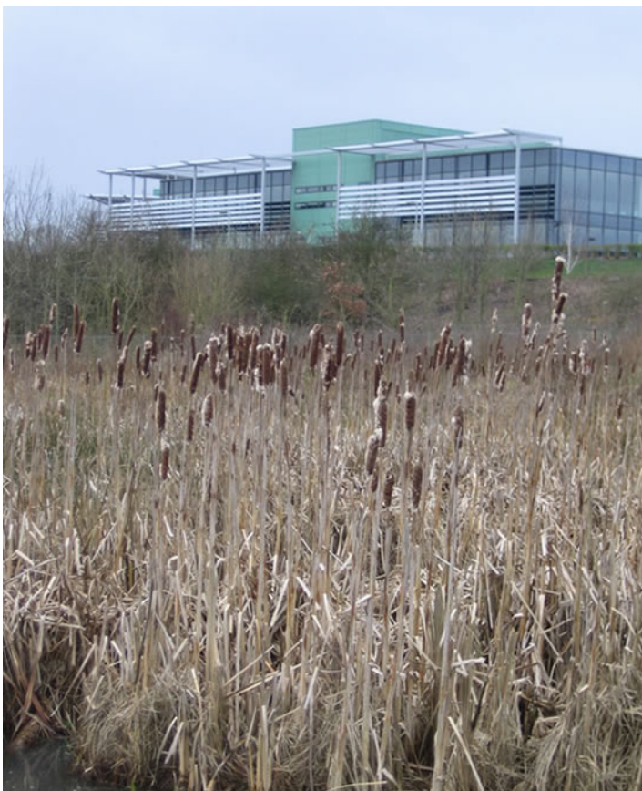
Figure 7: Blythe Pond

Source control was not achieved due to the Environment Agencies concerns that wetlands would dry out. The nature of the soil meant that extensive pond liners used in many areas were probably not necessary. Fears about drying out of the system proved unfounded. The age of the system and regular LMP inspections has enabled good quality performance data to be obtained. Close working with earthworks contractors is important to ensure opportunities to create gentle slopes and marginal shelves are taken. Vegetation growth creates biomass and slightly reduces attenuation volumes over time.