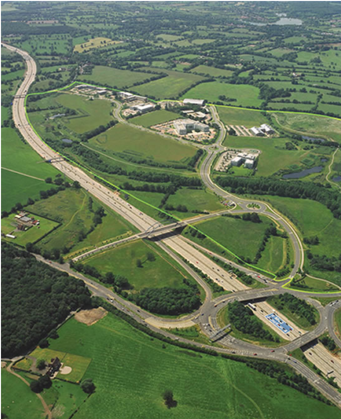
Figure 1: Aerial of Blyth Valley Park.

Blythe Valley Park is a business park in Solihull in the West Midlands. It is accessed from Junction 4 of the M42, on the A34 Stratford Road between Solihull and Hockley Heath. Post code B90 8AA.