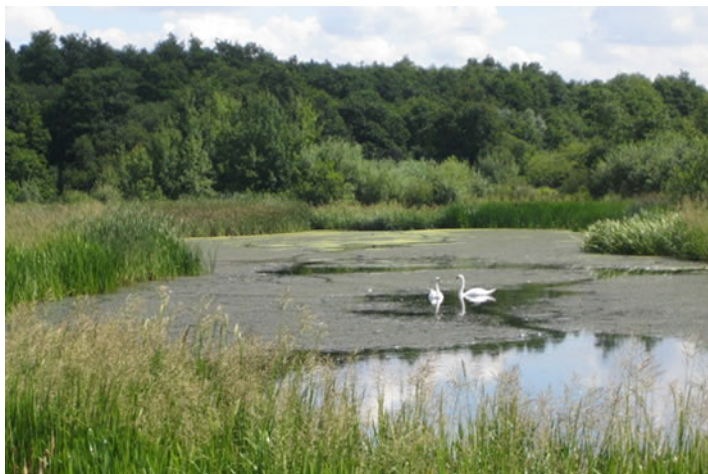
Figure 8: Mown path in Marlpit Fields