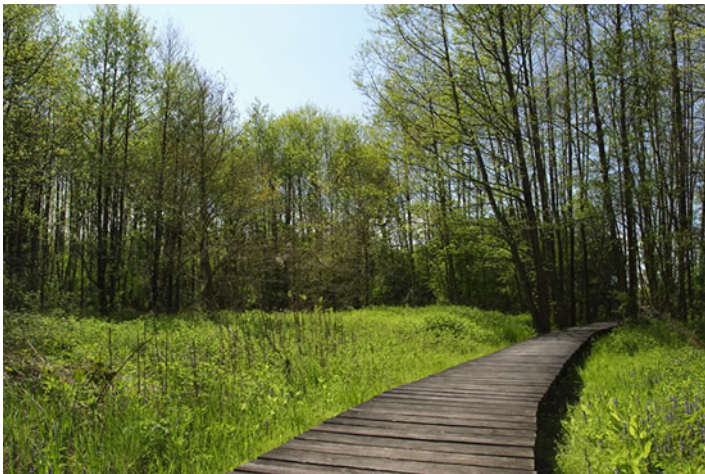
Figure 3: Boardwalk through Hawkeshaw Wood