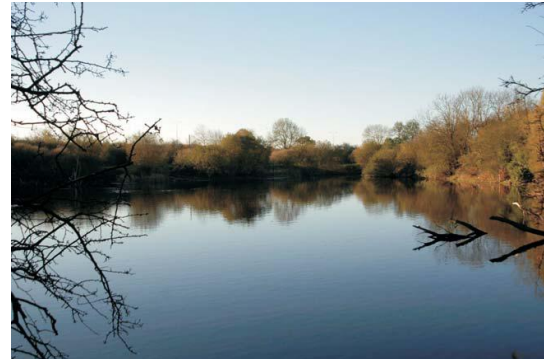
Figure 3 Nature reserve at Hampton

The robust works associated with the historic brick making created “ridge and furrow” terrain across much of the site, which later became home to the largest colony of Great Crested Newts in Europe (Figure 5). This protected area also holds the rare Lesser Bearded Stonewort (aquatic plant) (Figure 5). The surface water strategy had to accommodate this within the design and management to keep water networks separate, which was an important design requirement.