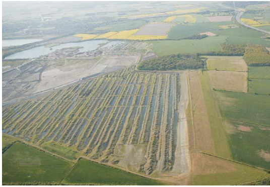
Figure 4 Special area of conservation