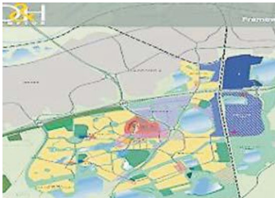
Figure 2 Hampton development layout

Hampton development is a mixed-use development consisting of 8000 residential units, 165 ha of employment and associated retail, community, education and leisure facilities (Figure 2).