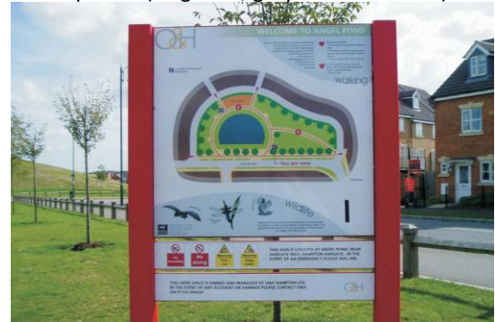
Figure 8 Information boards providing details of SuDS schemes

This new scheme uses a similar integrated SuDS design and strategy to that delivered successfully at Hampton. It benefits from the Hampton drainage strategy by using the existing lakes/SuDS features for surface water storage. This helps to maximise developable area, reduce upstream and downstream flood risk, reduce the risk of flooding to the protected SAC area and also will draw upon the drainage system as a source of water supply to maximise water resource efficiency across the development (irrigation, grey water uses etc).