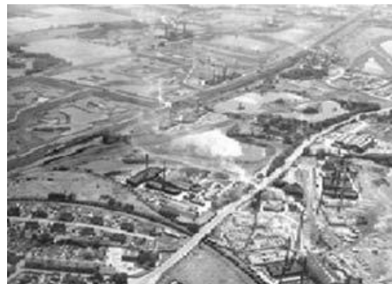
Figure 1 Hampton brickworks (c1900)

Development scheme proposals started to evolve around 1990, before SuDS concepts were fully established, at a time when the interface with water was discouraged (ie everywhere was fenced off), and before guidance for the development and integration of SuDS was in place. This was also long before water cycle strategies, strategic flood risk assessments and the recent Flood and Water Management Act 2010, all relatively new in respect of water management.