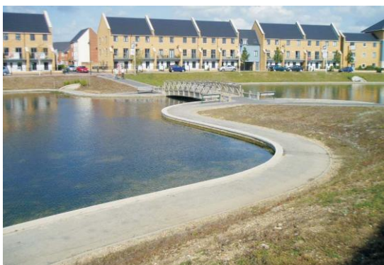
Figure 7 Landscaped SuDS pond

Finally, adoption of SuDS has proved to be the biggest challenge, with the landowner/developer still maintaining the SuDS. There is a S106 requirement for the development stating that SuDS will be adopted by "the relevant local authority", which is defined in the S106 as one or more of the local authorities, but this has yet to be confirmed and finalised.