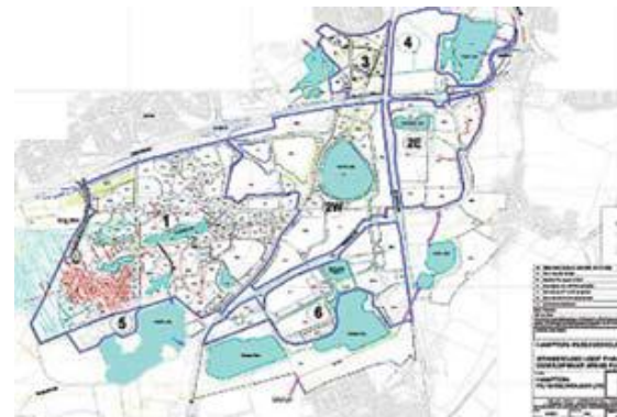
Figure 6 Drainage strategy at Hampton

The signage (Figure 8) not only conveyed the health and safety aspects, but also highlighted walking routes, health benefits (calories used for a given route), provided contact details for any queries and identified the wildlife to be observed in and around the SuDS features. Tree planting days were arranged with the local community and local school children.