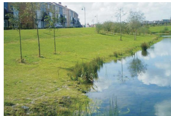
Figure 9 A SuDS pond with a shallow gradient

Part of the success in the good planning of many towns and cities has been accompanied by an improved public realm focusing on high quality and accessible water spaces, highlighting the importance of ensuring SuDS are designed into any given development correctly.