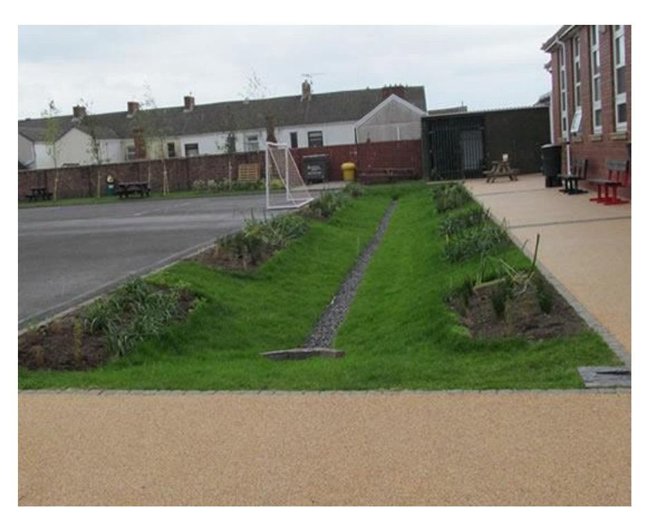
Figure 5 Swale

Due to lack of green space, it was not possible to keep all flows above ground, particularly on the elevation of the school nearest the car park. Wherever possible, the flows have been diverted into planters and the bioretention basin, but there was need for geocellular storage to be used. It was not possible to infiltrate flows due to the former land use in the area (mine workings). The scheme was designed in accordance with the SuDS Manual and constructed during the summer holidays in 2013. The overall scheme can be seen in figure 6 (designed to be understood by the school children).