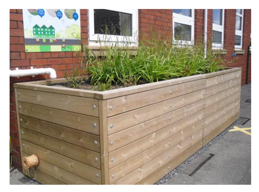
Figure 2 Downpipe disconnection into rain garden planter