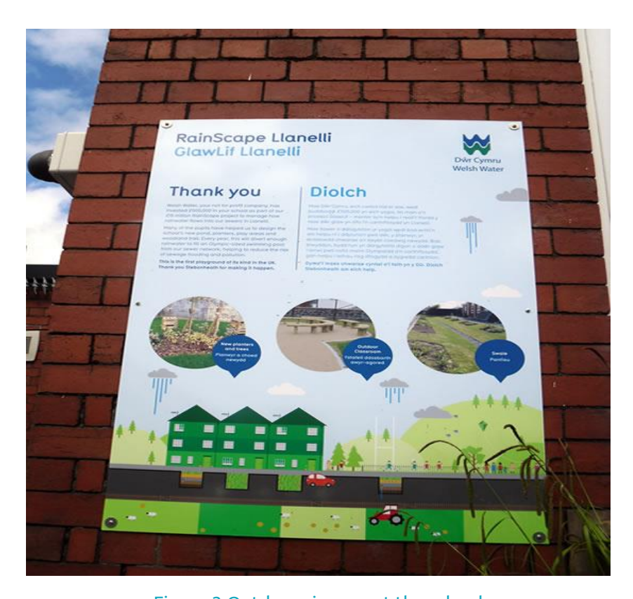
Figure 3 Outdoor signage at the school