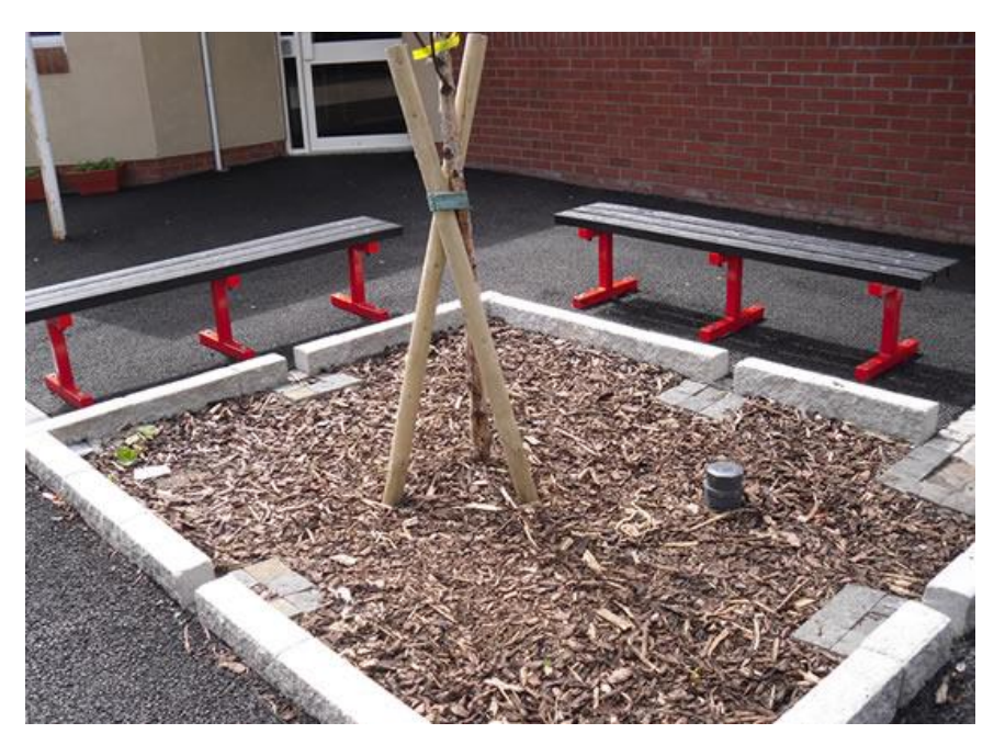
Figure 1 Tree pit planter