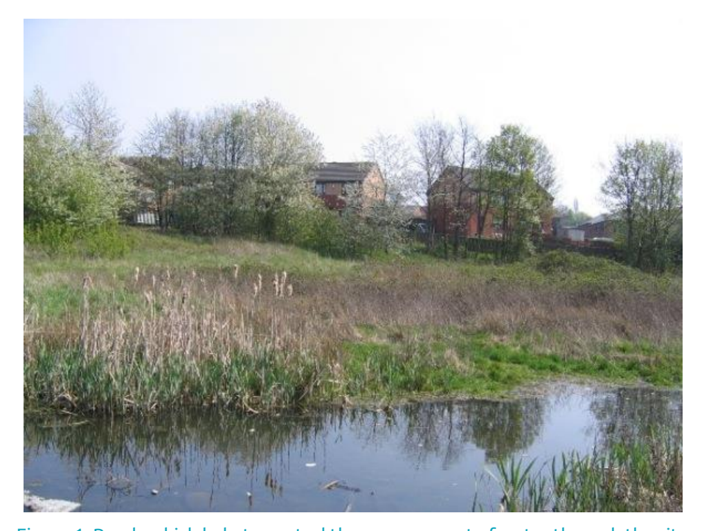
Figure 1 Ponds which help to control the management of water through the site

A series of ponds and basins to attenuate and treat road runoff from a new housing estate on brownfield land.