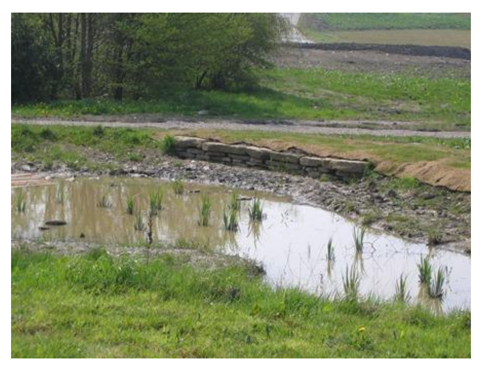
Figure 3 Turfing used to vegetate vulnerable areas of the system (Roger Nowell)

Turfing was used to vegetate vulnerable areas of the system such as overflow channels and the wet benches of the basins so that the system could be operational at an early date. The system was under a year's establishment post practical completion after which it was handed over to the Council. The upper basin was managed throughout the housing development period (2 years) by the developer as it was envisaged that this would receive considerable silt load