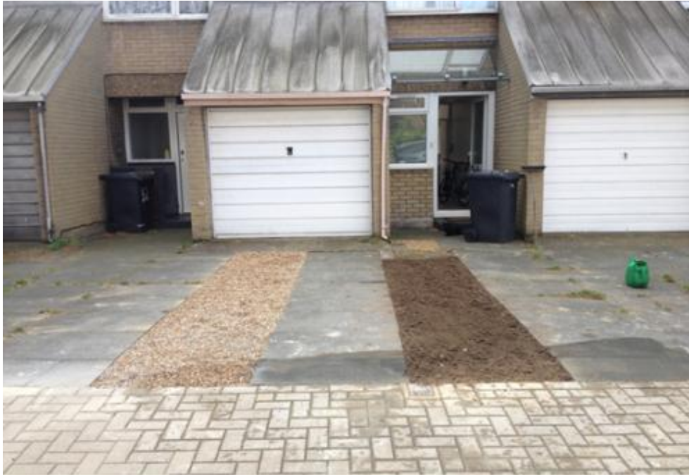
Figure 5 Reedworth Street after Depave (1)