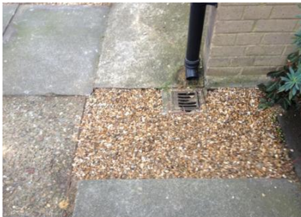
Figure 4 Downpipe detail

The event was publicised via Project Dirt and on twitter via various accounts to start at 8:30am, where tea and coffee would be ready. When work started and a depth of 200mm had been excavated it was realised that the base was rubble, sand and soil so it was decided to only excavate 300mm and loosen the base, as this would be suitable for drainage purposes.