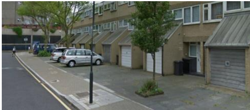
Figure 1 Reedworth Street