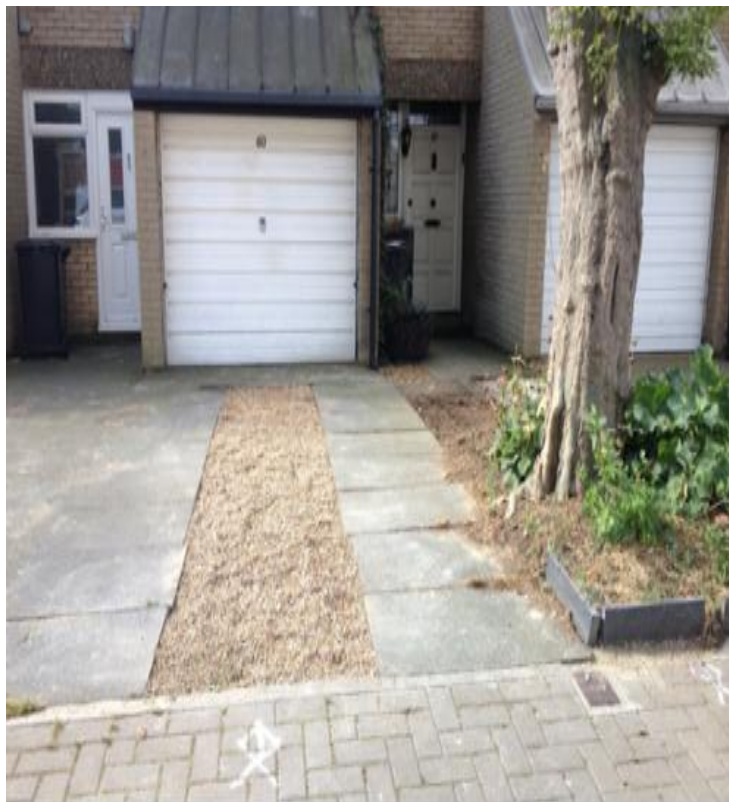
Figure 6 Reedworth Street after Depave (2)