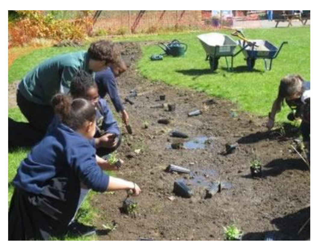
Figure 6 Hollickwood School planting (1)

The scheme didn't reduce the area of informal play space at all but vastly increased opportunities for play and learning about wetlands and surface water management. Children at Hollickwood are now much more aware about the need to manage rainfall sustainably and about the value of wetlands for people and wildlife. Added to that, they have fun, new places to play in.