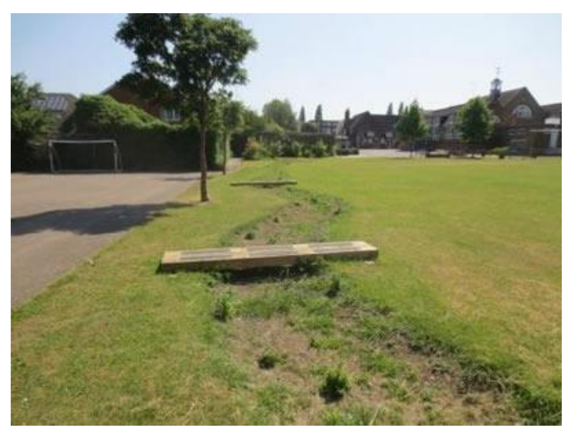
Figure 4 Detention area with bridges and planted with native plants

Overflow from this then travels via a short length of a drainage channel into a narrow, "tributary" grass swale and then into a larger grass swale which also carries additional surface water flowing off the tarmac playground in the upper school.