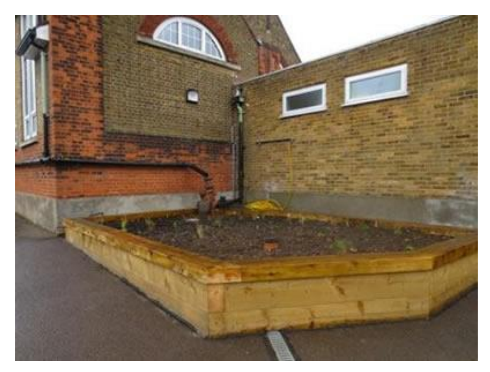
Figure 2 Bio-retention bog garden with seating showing disconnected downpipes and overflow drain

Rainfall from a portion of the roof space has been diverted to a newly-constructed raised bog garden planted with native wetland plants (and which also doubles as a meeting place with an integrated seating area for parents and children).