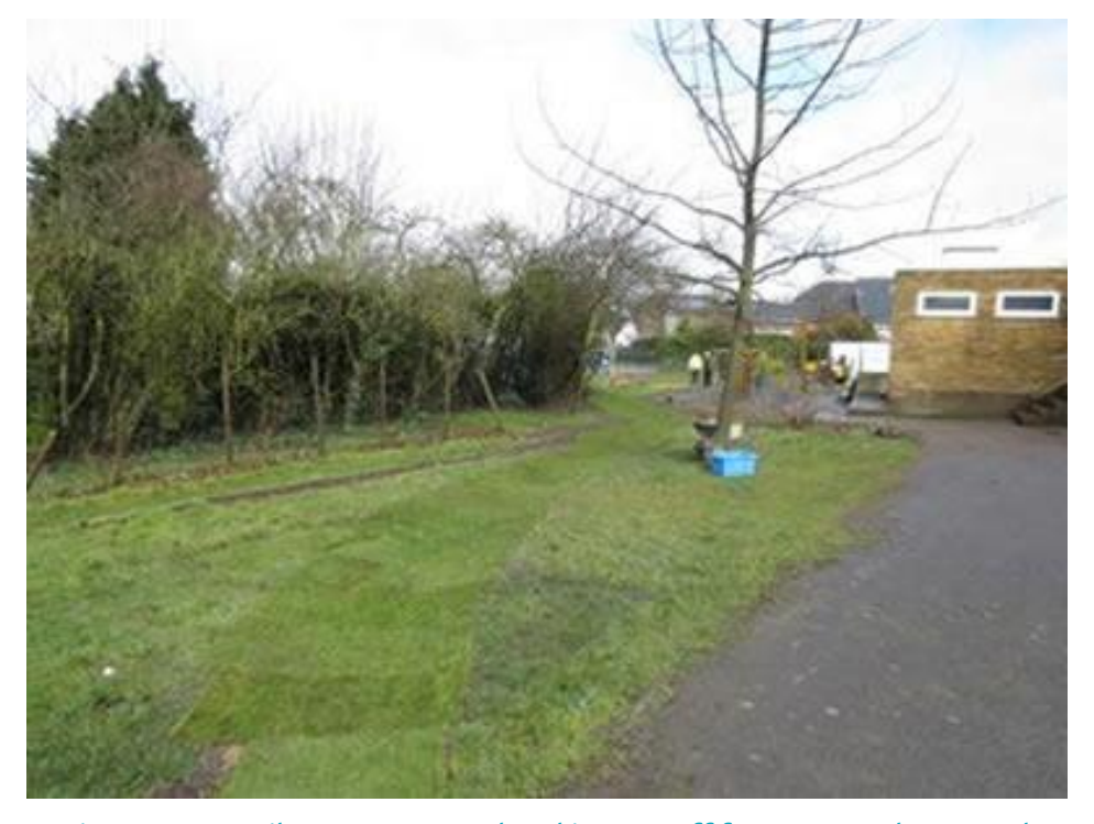
Figure 3 New tributary grass swale taking run-off from upper playground

Rainfall from a portion of the roof space has been diverted to a newly-constructed raised bog garden planted with native wetland plants (and which also doubles as a meeting place with an integrated seating area for parents and children).