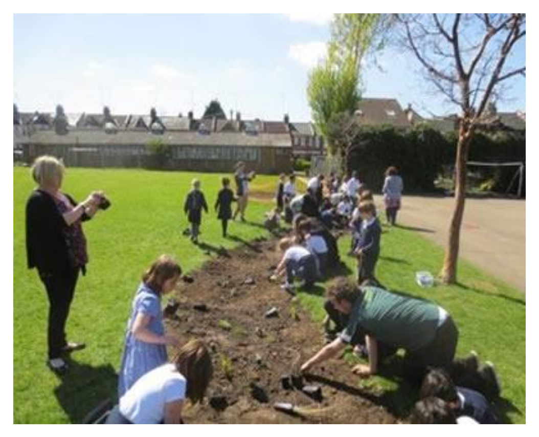
Figure 7 Hollickwood School planting (2)