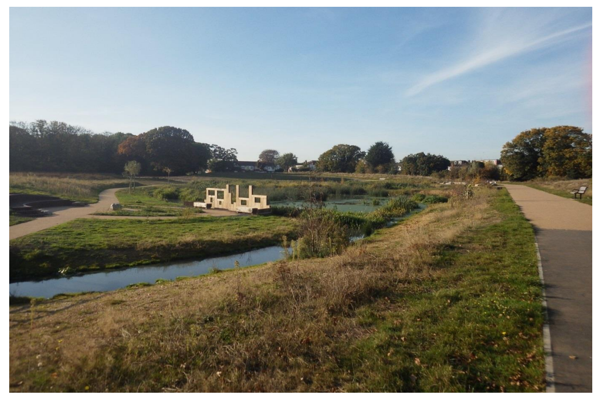
Figure 6: Overlooking downstream wetland