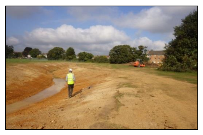
Figure 2 Firs Farm Site after completion of Phase 1

Phase 1 of the scheme involved excavating the footprint of a new 500m long open watercourse with an average depth of 1.5m. Excavated spoil from the new channel was used to create a natural earth flood bund along the eastern boundary of the site. This ensures that flood water is stored on the playing fields during extreme rainfall events, increasing protection to nearby houses. The new flood storage area is below the threshold of a statutory reservoir (25,000m<sup>3</sup>). Nevertheless it was constructed to the required standard for an asset of this status in strict accordance with a methodology approved by a Qualified Reservoir Engineer; this included the appropriate degree of compaction and testing of the suitability of the material. This was to ensure that the new feature is safe for local residents.