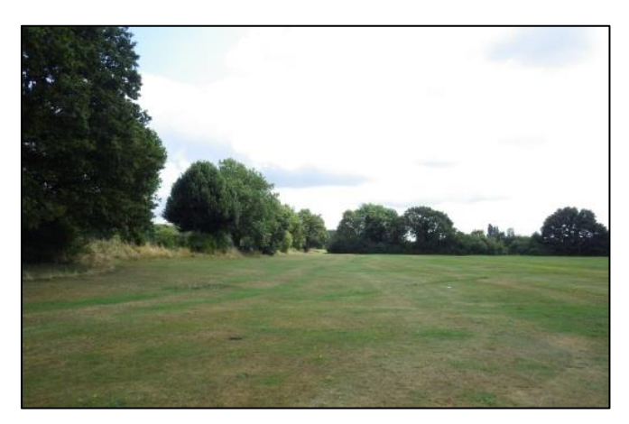
Figure 1 Firs Farm Site prior to implementation

Given that the presence of the scheme was likely to attract a greater number of users to the site a wider consideration of the public health and safety was required during the design. The gradients of the slopes of the wetland cells are designed to have a maximum fall of 1 in 3 for example.