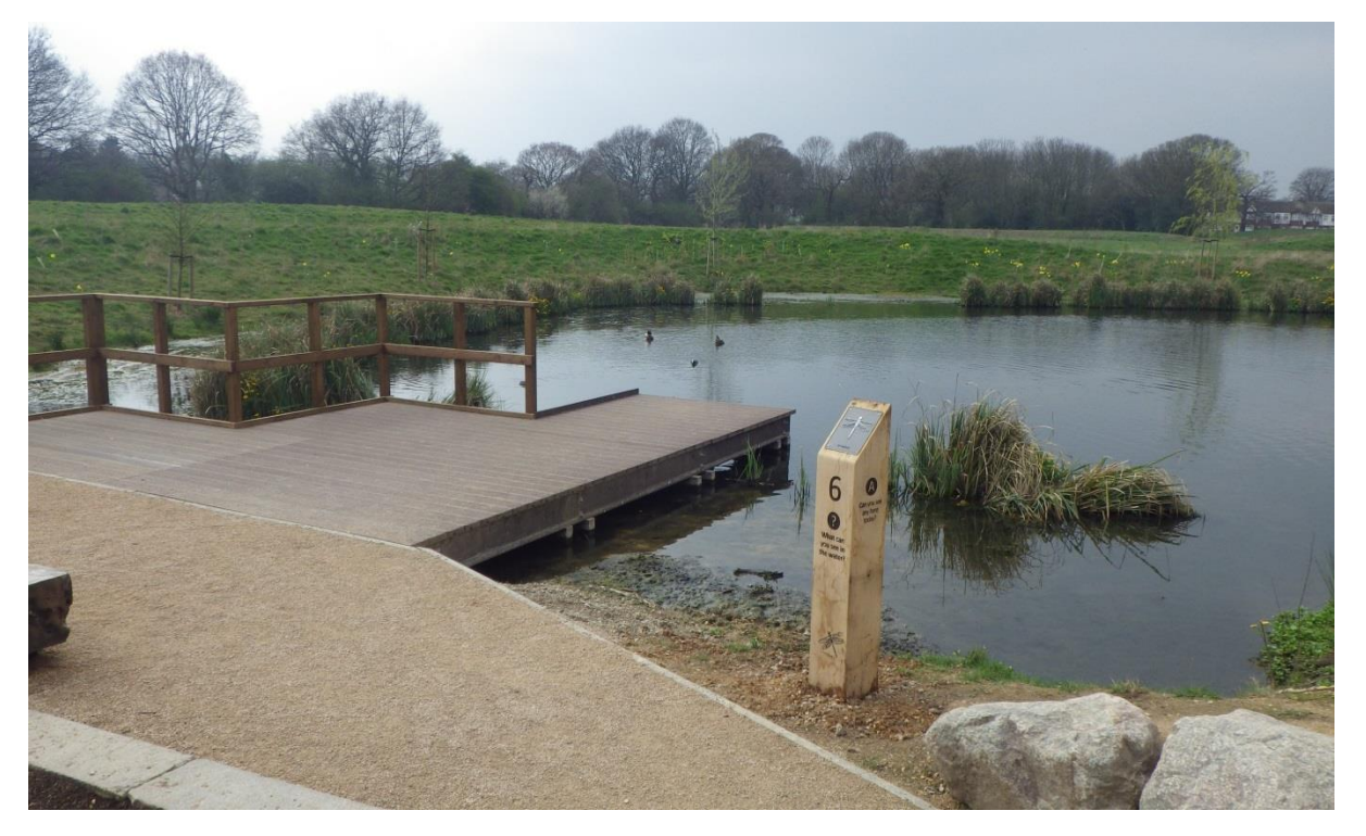
Figure 5 Wetland