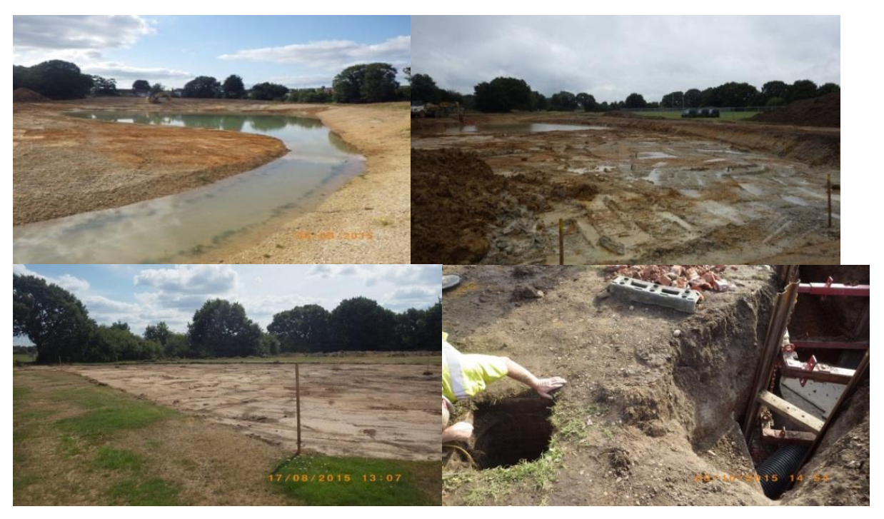
Figure 3 Montage of construction pictures