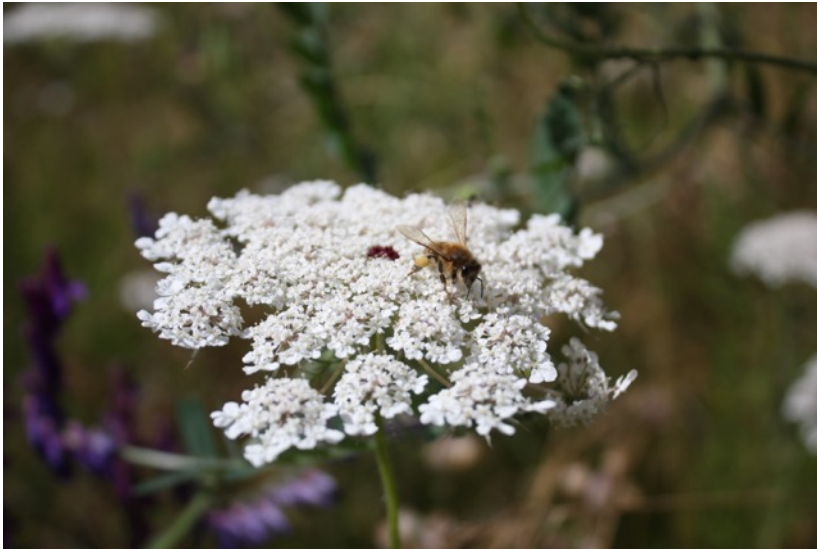
Figure 13: The site attracting a honeybee