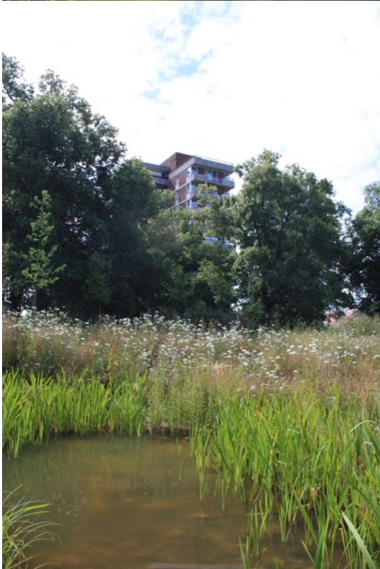
Figure 12: The site provides a natural haven in an urban setting