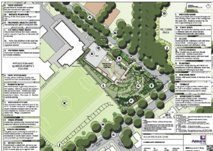
Figure 2: Landscape proposals (click image to enlarge)