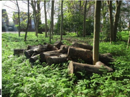
Figure 10: Habitat piles have been created in the existing woodland using timber felled on site

Challenges and lessons learnt DSA, being involved from the outset, were able to propose a 'soft' SuDS solution to take advantage of the site levels.