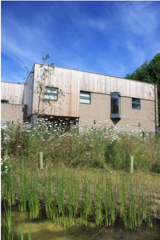
Figure 11: The Swales continuing to work well