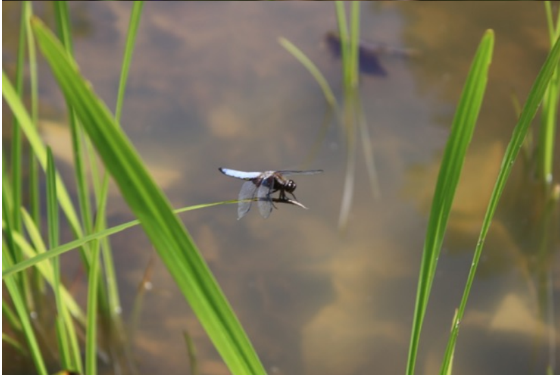
Figure 14: Broad Bodied Chasers are now also found on the site, attracted by Swales.Team and details