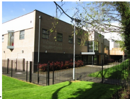
Figure 1: Victoria Park Health Centre main entrance

Description The Victoria Park Health Centre (VPHC) development is a two-storey health centre. The site is roughly 0.7 hectares in size and the site of a WW11 air raid shelter. Work began on the health centre in 2010 and was completed in winter 2013. The landscape design approach was intended to 'tie' the proposed scheme into its context and protect and enhance the landscape setting. The landscape design was developed in tandem with the architectural layout, to ensure that the proposal 'sits' comfortably within the existing landscape.