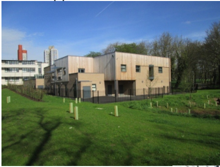
Figure 9: View of the health centre from the bund that partly

Visual appeal is considerable: basins can be viewed from inside the health care centre.