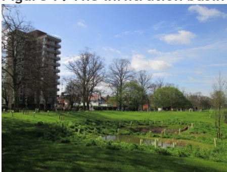
Figure 8: View towards Victoria Park Road and neighbouring residential area Benefits & achievements

The biodiverse roof improves air quality and insulation of the building.