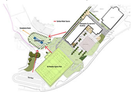
Figure 1. Major drainage elements

Telford & Wrekin Council proposed a brand new school as part of the Building Schools for the Future Programme: the Oakengates Co-operative Academy formed from Sutherland Business and Enterprise College and Wrockwardine Wood Performing Arts College. The project encompassed substantial refurbishment to the existing leisure centre, a new school which together with a new all-weather sports field and car park formed three substantial drainage elements indicated in Figure 1.