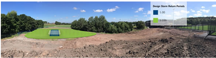
Figure 2. Looking out toward the proposed attenuation area

required shallow excavation and facilitated re-use of site spoil that would have necessitated off-site disposal. This design then communicates to a much larger surface area enabling the management of drainage exceedance caused by rare events.