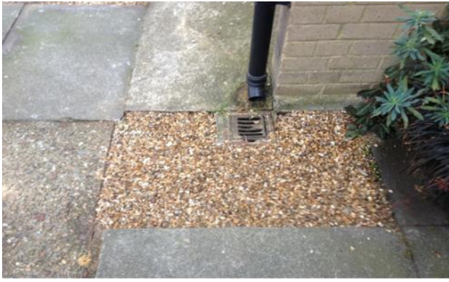
Figure 4 Downpipe detail

The Depave started at 8:30am and finished at 12:30pm it took 4 hours to Depave the two gardens, both gardens look different as can be seen in Figures 5 and 6 which show the completed work.