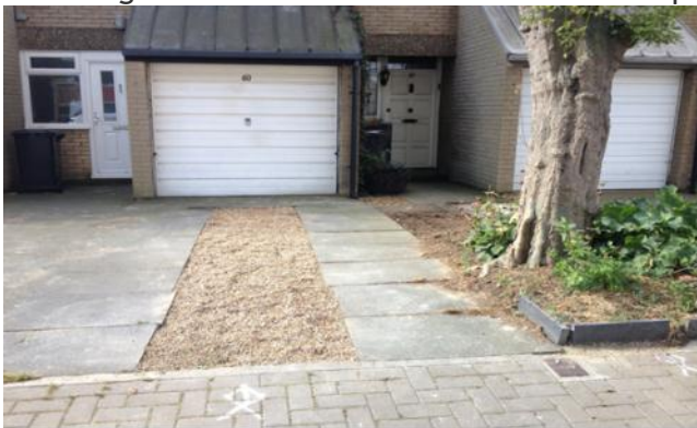
Figure 6 60 Reedworth Street after Depave