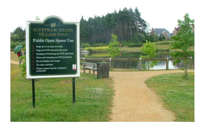
Figure 1 Elvetham Heath village pond

The detention basins were designed to be relatively shallow and to have an outlet invert level approximately 150mm above the base of the unit. This was done to encourage infiltration.