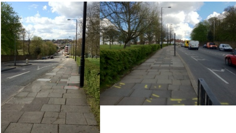
Figure 1 Central Hill (down)

Central Hill is part of the Principle Road Network (PRN) A214, it is a main east west route linking Streatham and Crystal Palace. As part of the PRN the road is heavily trafficked with two bus routes. Central Hill starts at its junction with Elder Road, and heads East up hill to Crystal Palace. Elder Road is the lowest point of Central Hill as this is the original route of the River Effra which rose in Upper Norwood. Within Lambeth there are three known natural springs which appear along the 85m contour, one of these springs is at the junction of Central Hill and Salters Hill. This section of Central Hill falls within a Critical Drainage Area (CDA) identified within Lambeth's Surface Water Management Plan (SWMP)