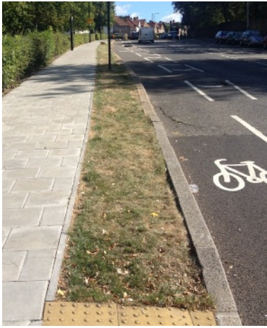
Figure 6 Central Hill (after up)