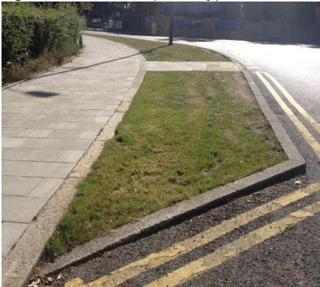
Figure 7 Elder Road (build out after)

In hindsight it is clear that consideration should have been given to introducing check dams along the verge in Central Hill, it is also felt that a cut off drain should have been installed in the build out close to where the existing gully is located.