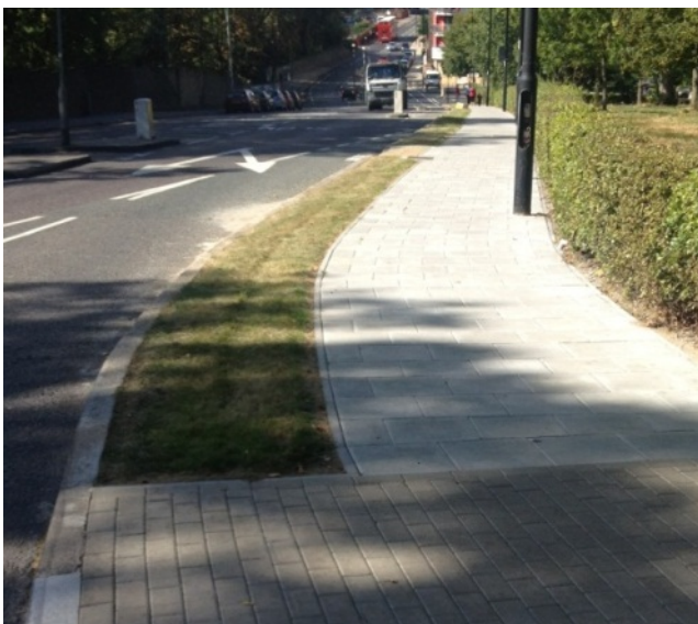
Figure 5 Central Hill (after down)