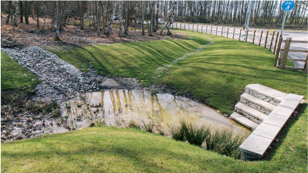
Access Road at Jehovah's Witnesses Britain Headquarters, Chelmsford