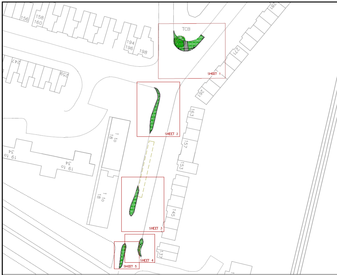
Figure 5 Rain Garden Layout

Due to existing cross-overs there was little opportunity to construct rain gardens on the eastern side of Alma Road, therefore most of the rain gardens were installed on the western side.