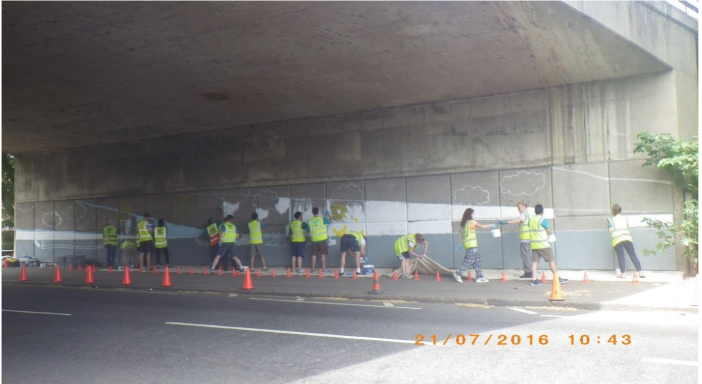
Figure 10 Volunteer event – mural painting