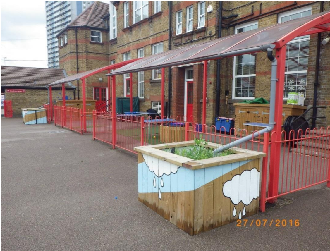
Figure 12 Alma Road Primary School raised planters