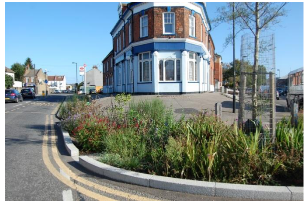
Figure 4 Alma Road/Scotland Green Road junction after with permeable footway

It was recognised that the existing traffic calming measures, two speed cushions, in this particular stretch of road did not help to reduce speeds to the required 20 mph. This posed some risk to the nearby Alma Road Primary School. The speed cushions were removed and replaced by rain gardens 4 and 5 (RG4 and RG5). These act as horizontal traffic calming by giving the impression that the road is narrowing.