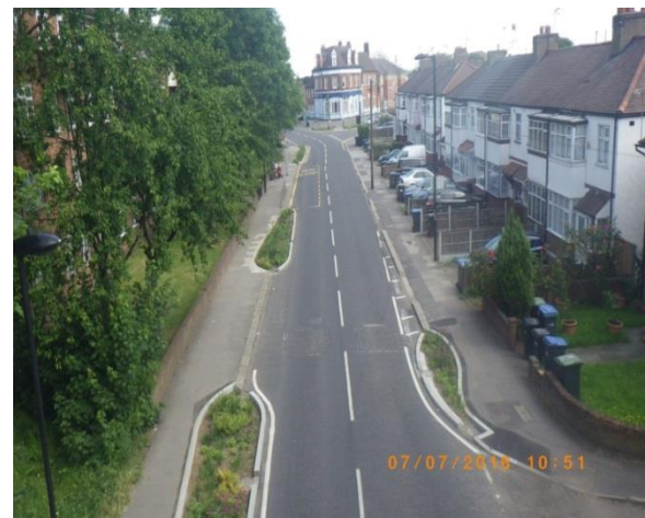
Figure 2 Alma Road after

The first phase of the scheme also created the opportunity to utilise the rain gardens for horizontal traffic management. The junction between Alma Road and Scotland Green Road had a bell-mouth which was over 30 m wide, which compromised the safety of crossing pedestrians. A new rain garden (RG1) was built into the carriageway to reduce the width of the bell-mouth with a new permeable paved pathway running through it.