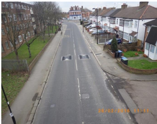
Figure 1 Alma Road before