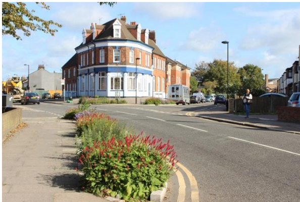
Figure 3 Alma Road/Scotland Green Road junction