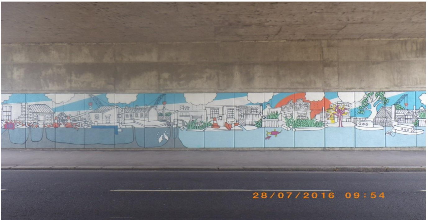
Figure 11 Mural finished – story of rivers and pollution