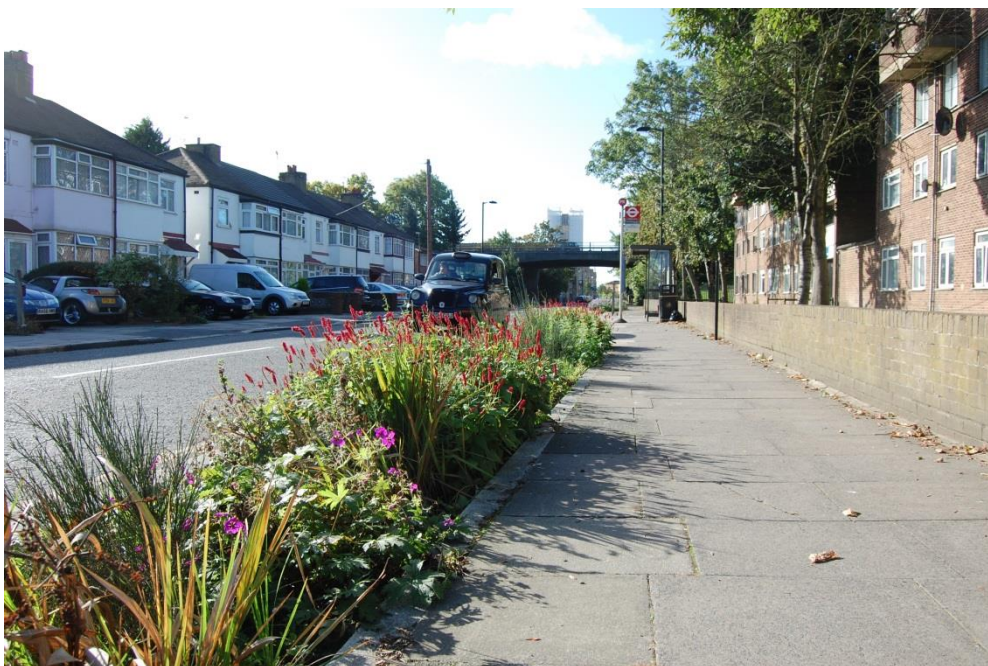
Figure 8 Rain garden component

The rain garden plants manage contaminants from road runoff. Specific plants that were both drought tolerant and could survive in waterlogged conditions were chosen.