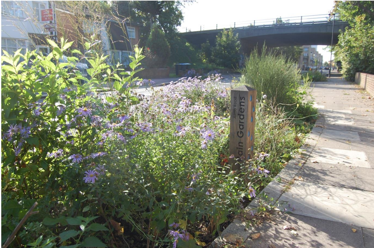
Figure 9 Rain garden's signpost