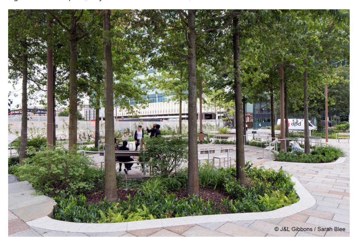
Fig 5: Ruskin Square, July 2017.