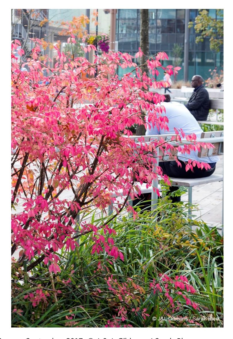
Fig 6: Ruskin Square, September 2017.