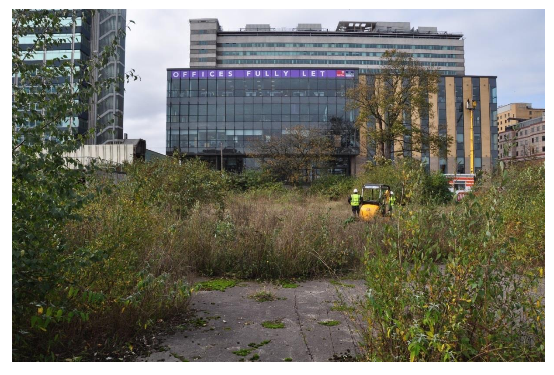
Fig 1: Ruskin Square, Oct 2014 – Before development.