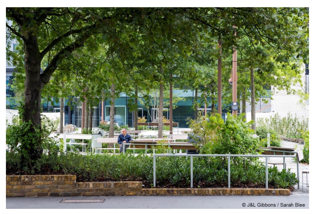
Fig 4 Ruskin Square, July 2017.