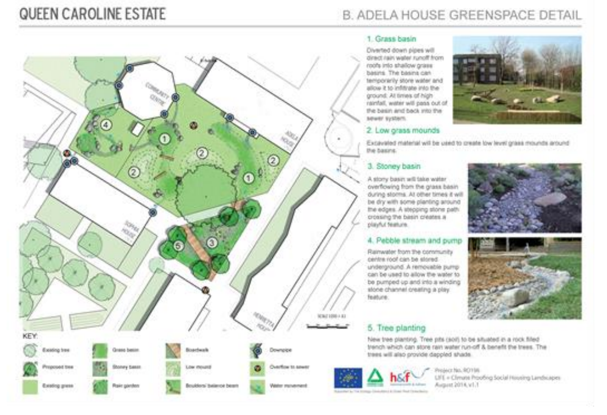
Fig 1 Queen Caroline drainage rationale for consultation