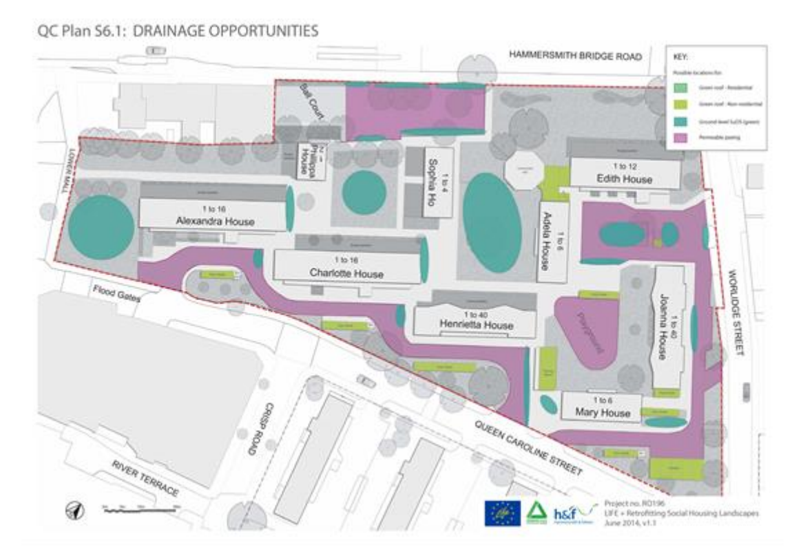
Fig 3 Queen Caroline Site Plans_Drainage opportunities