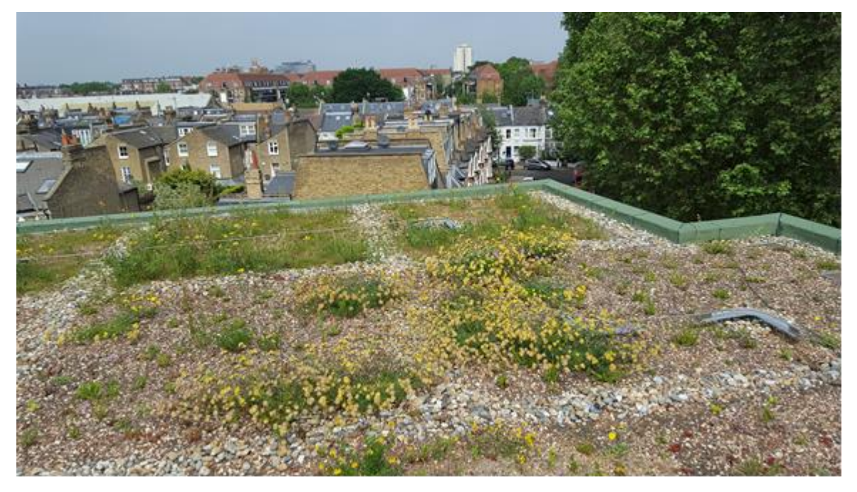
Fig 8 Richard Knight biodiverse extensive green roof