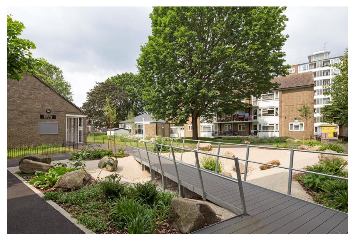
Fig 5 Queen Caroline Schotterasen gravel garden, adjacent to Adella House, and permeable paving and composite deck