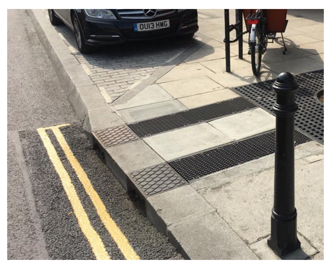
Fig 6: Kerb Inlets