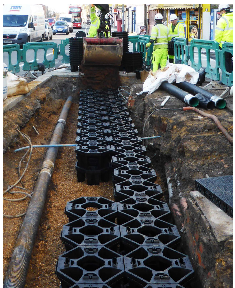
Fig 3: Tree pit cells being filled during construction